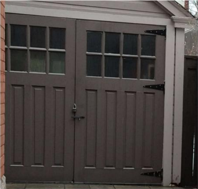
Existing garage doors (replaced in the 90s, per owner)