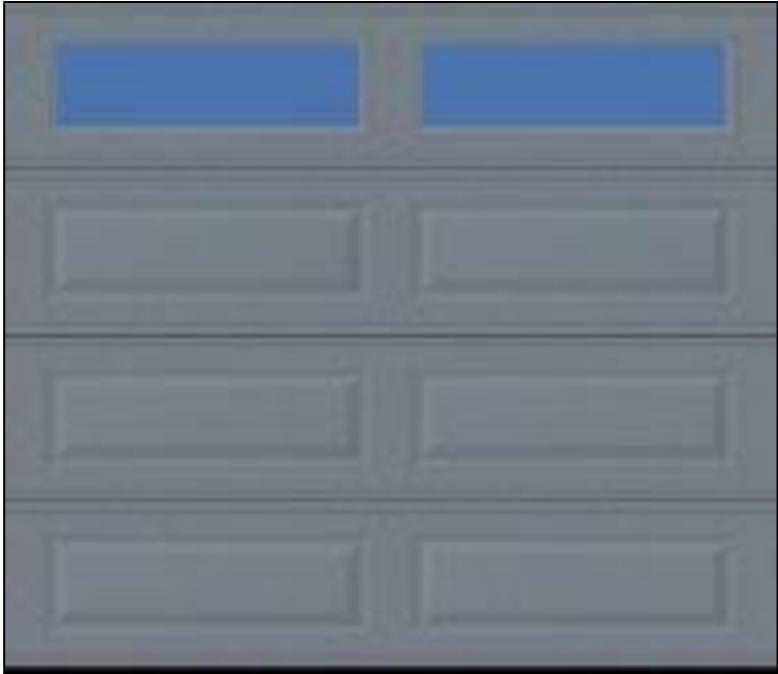
Proposed replacement steel garage door. "Slate" colour grey to match the new siding on the house.