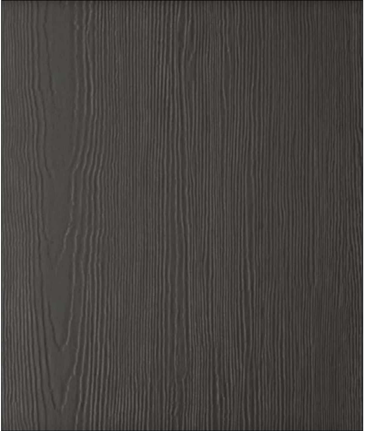
Example Hardie panel trim siding.