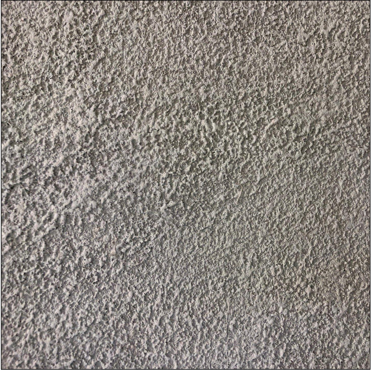
Example Wall Theory/or Hardie Board stucco panel.