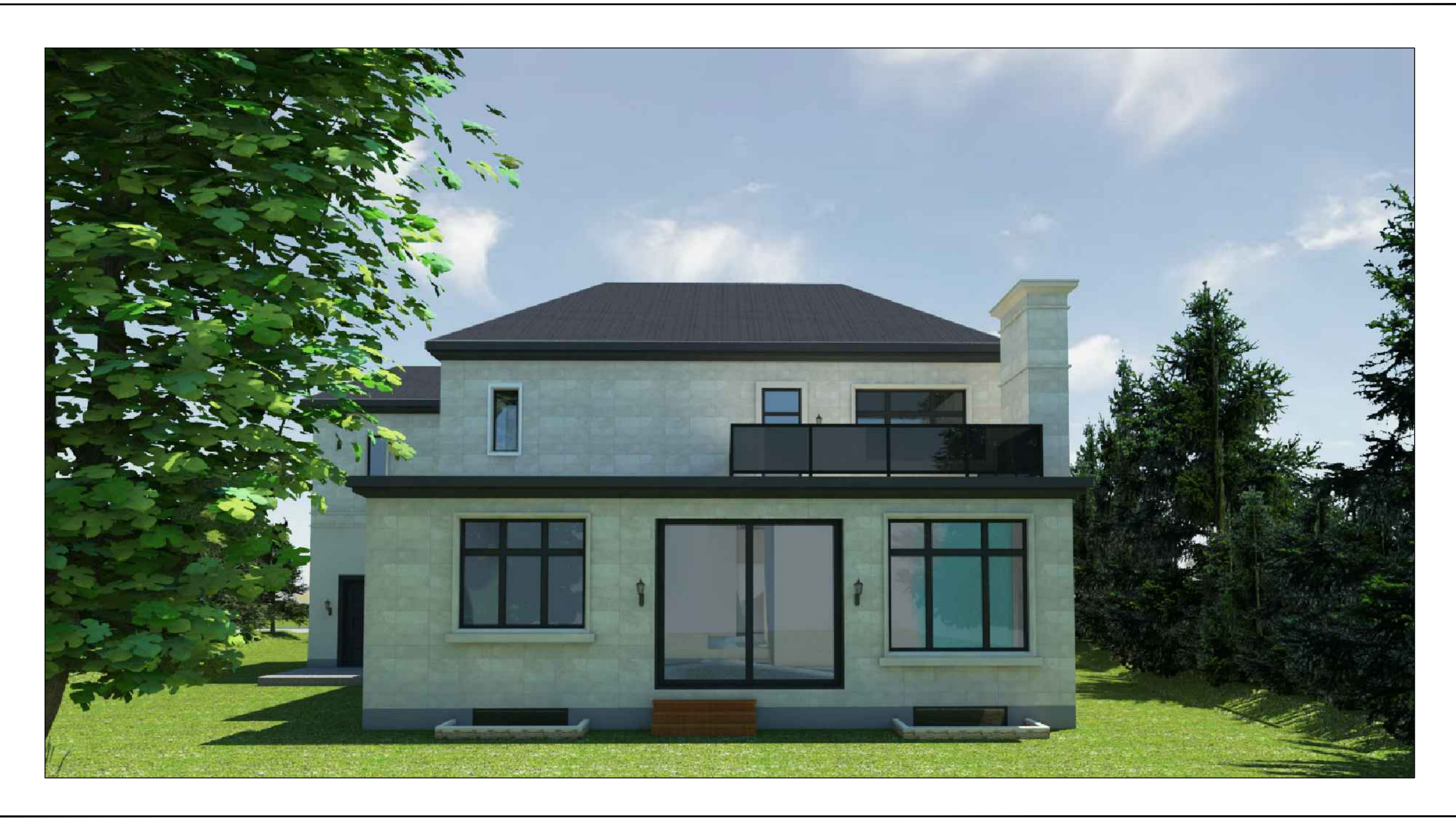
4 REAR ELEVATION VIEW (WEST) A8 NTS