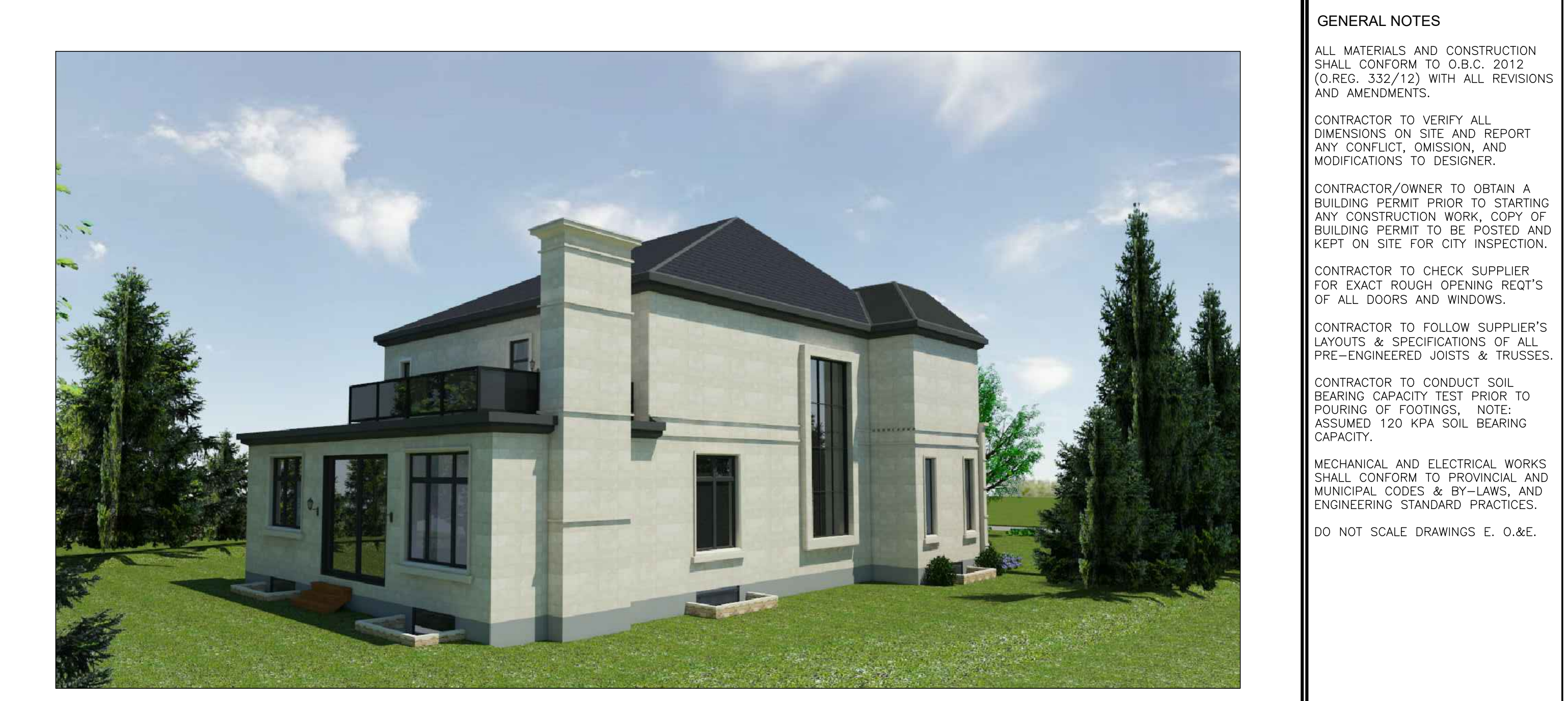
3 LEFT SIDE ELEVATION VIEW (SOUTH-WEST) A8 NTS