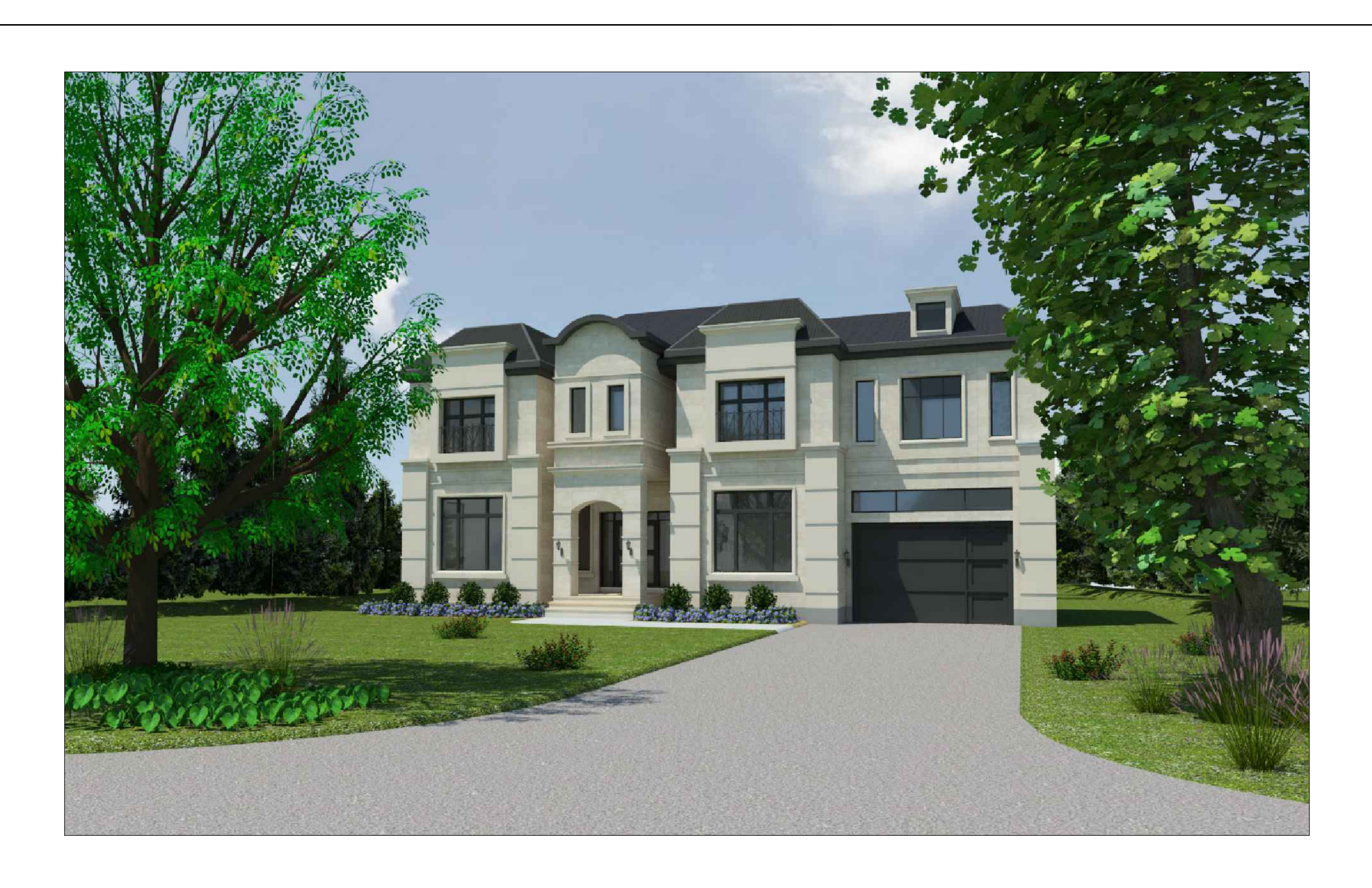
1 FRONT VIEW (EAST) - FROM THE STREET A8 SHOWING DRIVEWAY AND EXISTING TREES - NTS