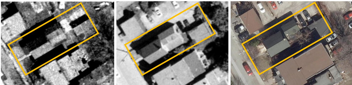
Above: GeoOttawa aerial images (1965, 1991 and 2021) © City of Ottawa.