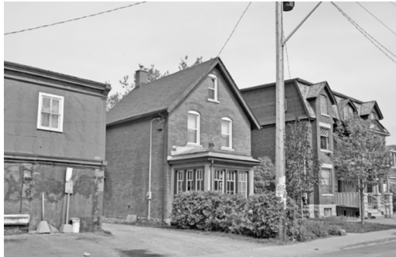
Figure: 95 Henderson Avenue, May 2007, Ron J. Roy.

The property is historically linked to its surroundings as part of the gradual the development of the By Estate in the late 19 th and early 20 th century. It is one of several gable-front or red brick houses along Henderson Avenue built in this era, moderately contributing to a cohesive streetscape along Henderson Avenue that contains other low-rise red-brick buildings with similar heights, setbacks and design elements.