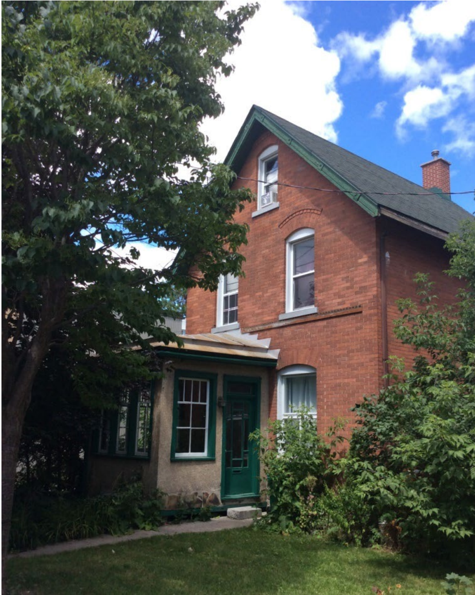
95 Henderson Avenue, Aug 2016, City of Ottawa.