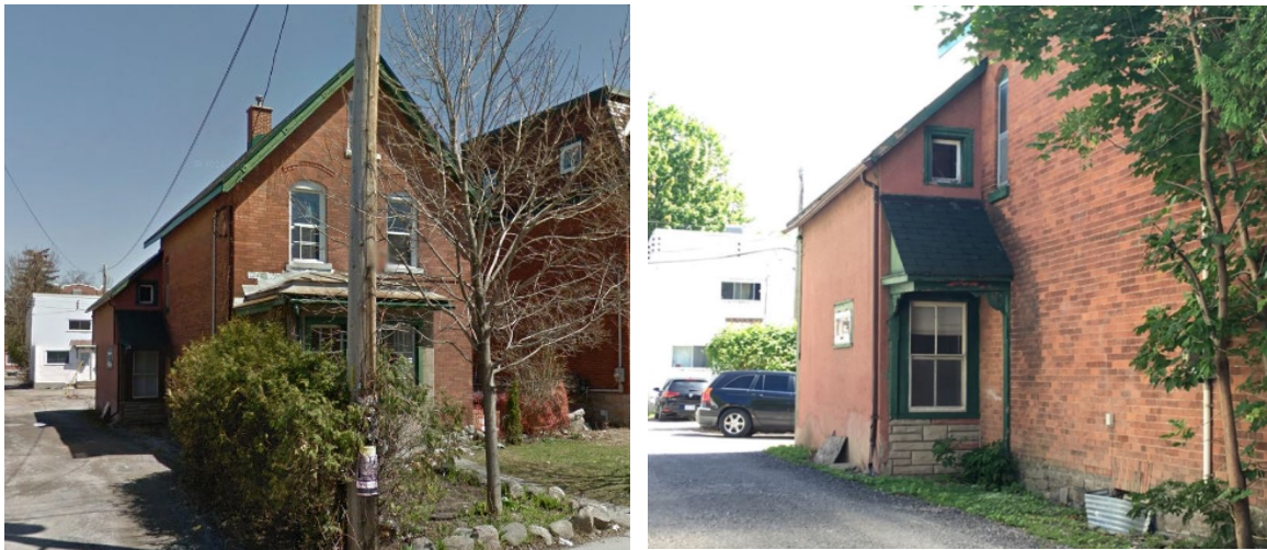
A one- and one-half storey house constructed in the 1890s is visible on the north elevation. Left: Street View – Apr 2014 © Google 2022. Right: City of Ottawa, August 2022.

Although 95 Henderson Avenue is an example of a gable-front house, and the gable-front house is a common building type, replacement windows and the loss of the veranda, among several other minor alterations, diminish the architectural integrity of this simple house.