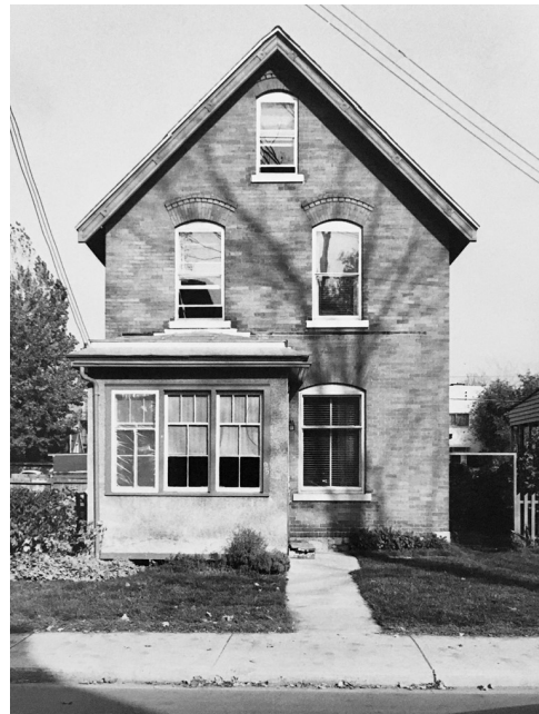
City of Ottawa file photo, no date.

The gable-front house is a common building type found across Ottawa and is widely seen throughout Ontario. This building type may also be described as a front gable cottage or as a gable-end-to-street. Gable-front houses have a street-facing gable roof, simple form, consistent window openings, a rectangular footprint and typically feature an off-centre door and an entry porch or veranda. Although the design interpretation is vernacular, many