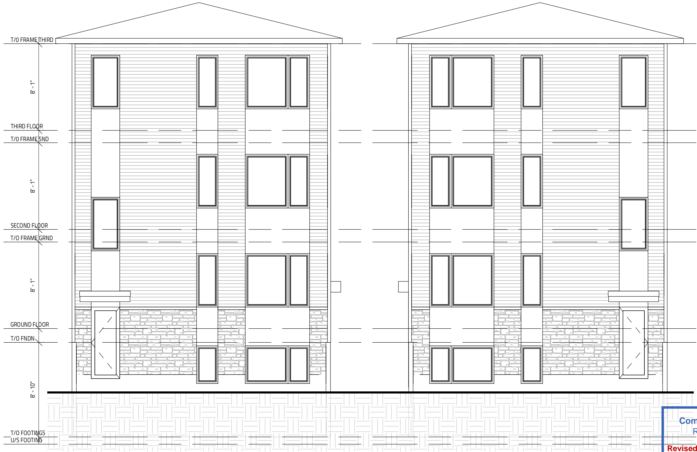
1 REAR ELEVATION SCALE: 3/16" = 1'-0"

Committee of Adjustment Received | Reçu le Revised | Modifié le : 2022-09-02 City of Ottawa | Ville d'Ottawa Comité de dérogation