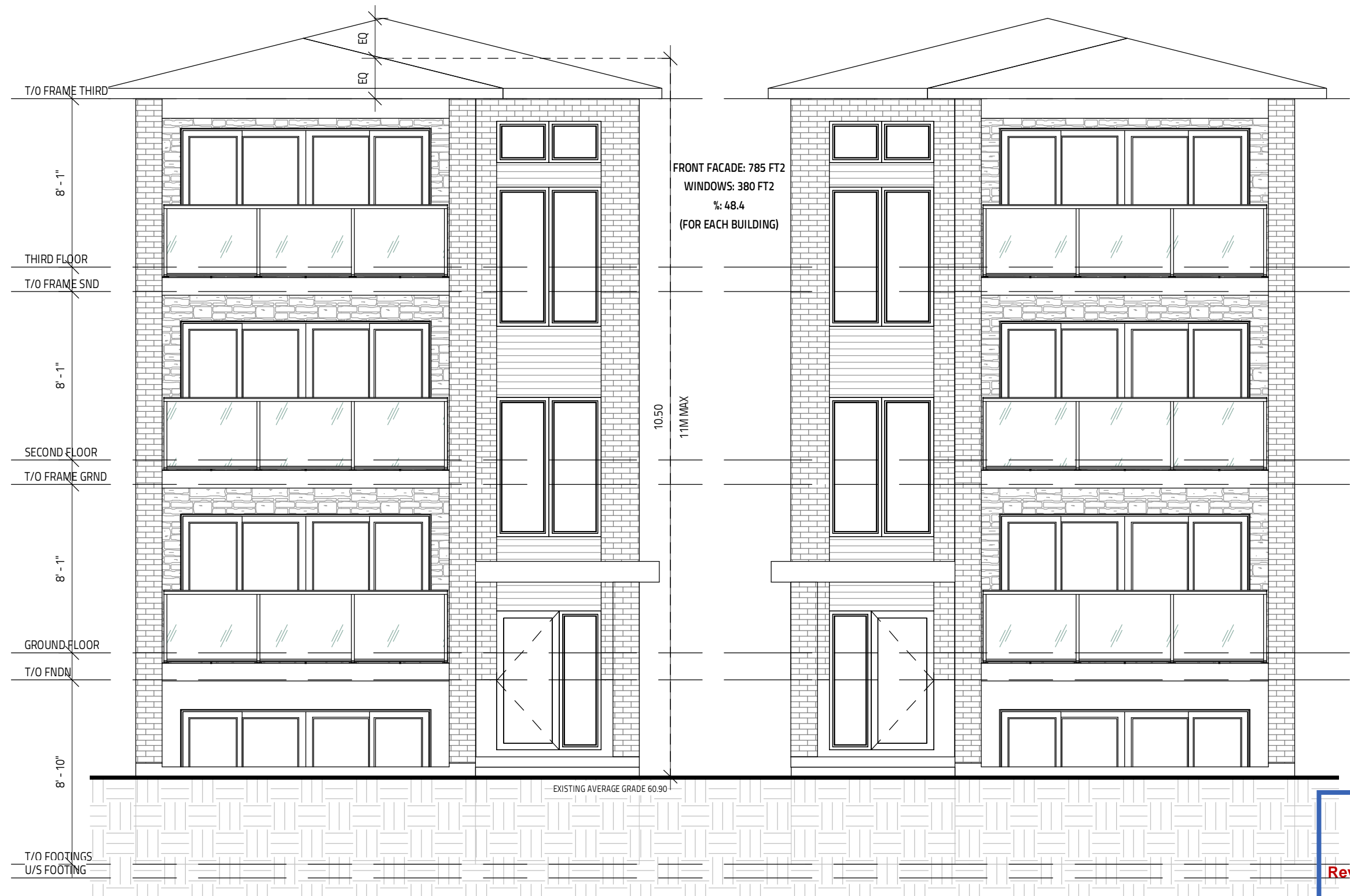
1 FRONT ELEVATION SCALE: 3/16" = 1'-0"

Committee of Adjustment Received | Reçu le Revised | Modifié le : 2022-09-02 City of Ottawa | Ville d'Ottawa Comité de dérogation