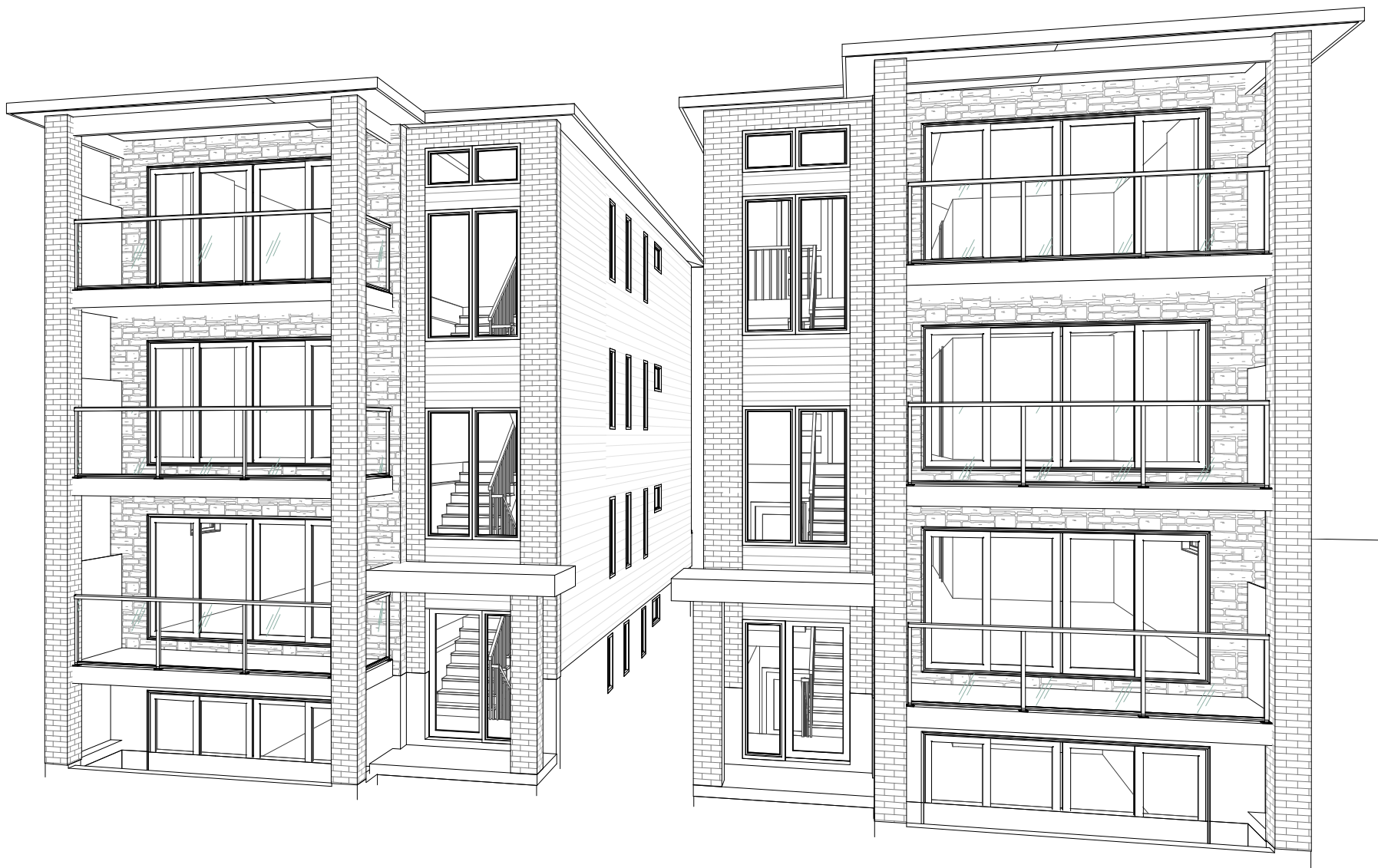
1 FRONT RIGHT PERSPECTIVE