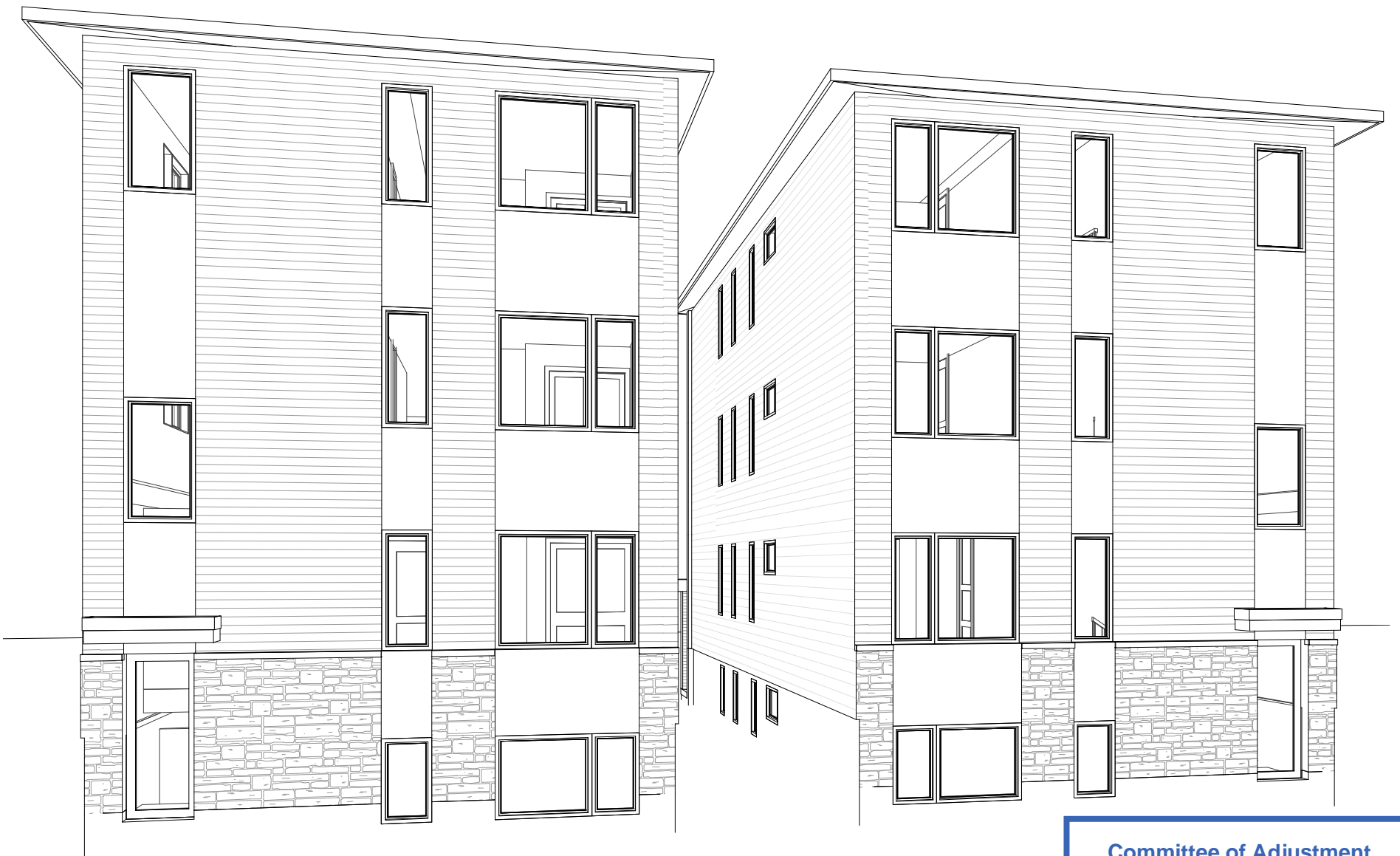
2 REAR LEFT PERSPECTIVE