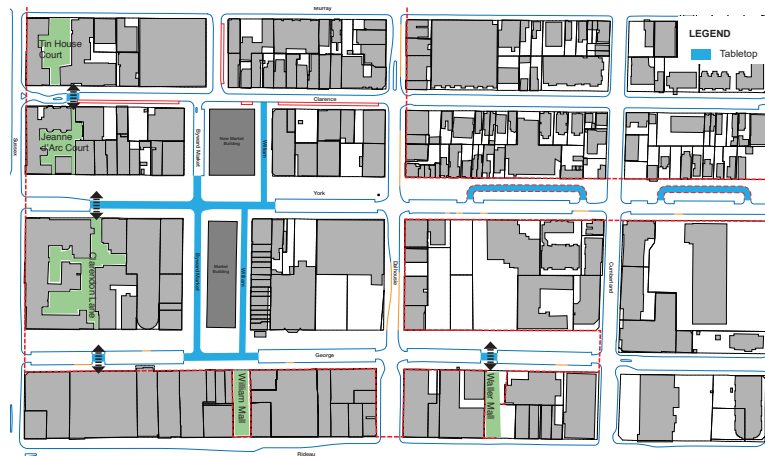
TABLE TOP STRATEGY

Do you agree with the location of table tops?