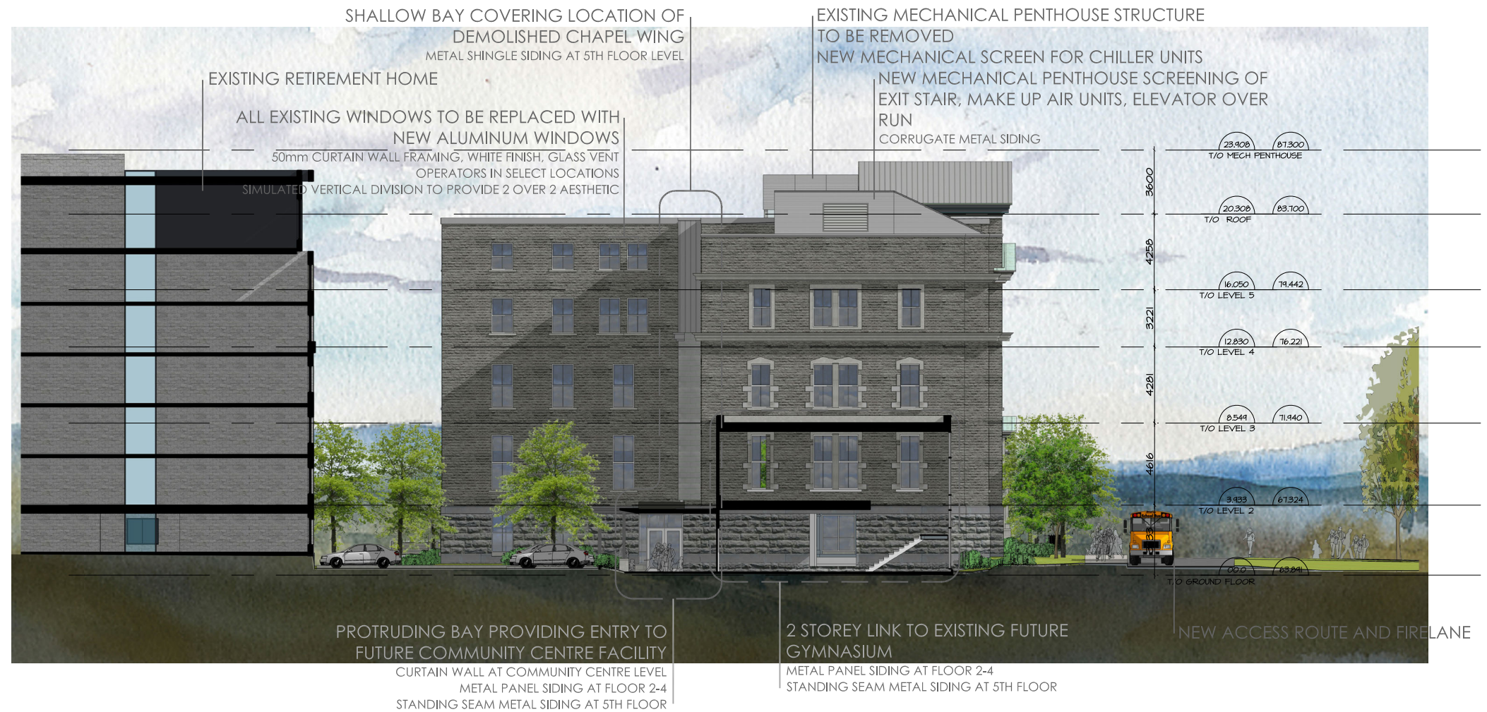
NORTH ELEVATION SECTION THROUGH LINK