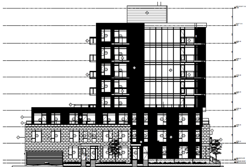
East Elevation Phase 1 Archibald Building