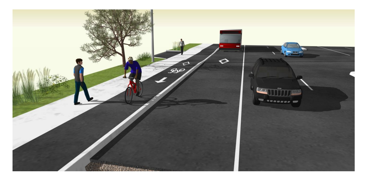
Figure 2- Transit Lanes with raised Cycling Track.