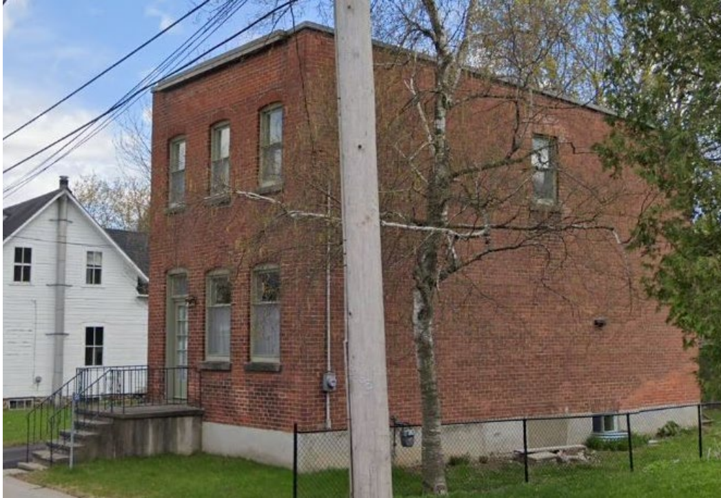
West elevation