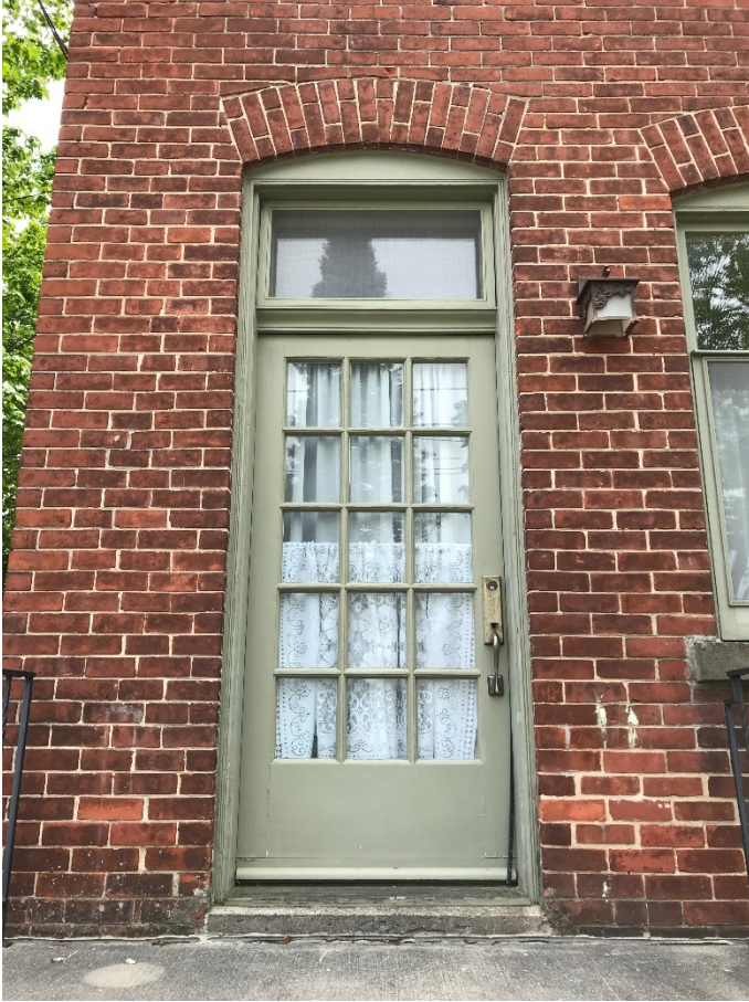
Detail of door opening showing segmental arch, voussoirs and stone sill