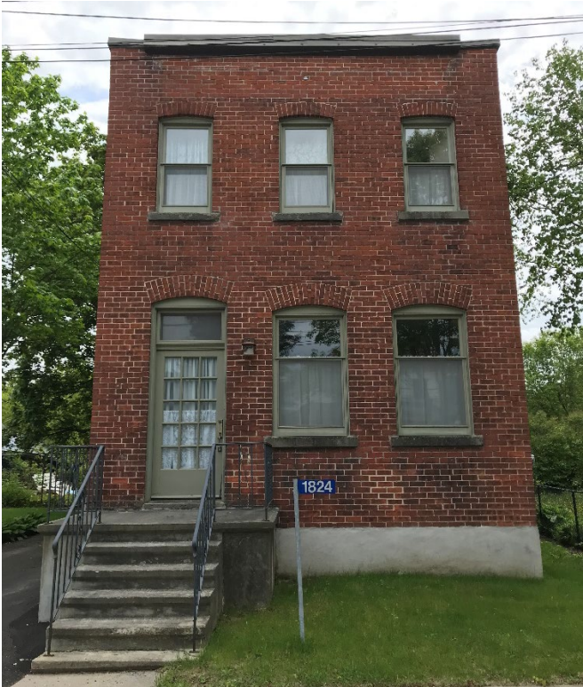
Front elevation of 1824 Farwel Street showing the two-storey form and massing