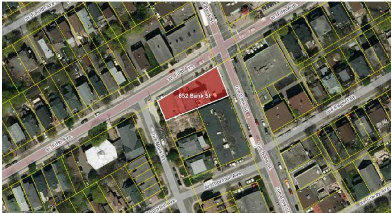
852 Bank Street