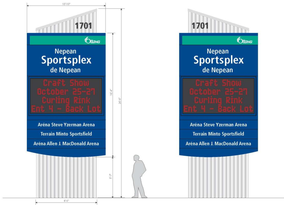
Figure 2 Proposed New Sign for 1701 Woodroffe Avenue