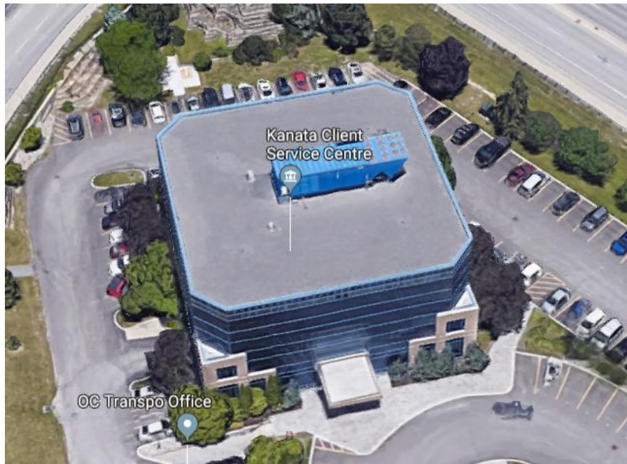
Figure 2: 580 Terry Fox Drive - City Leased Space – 8,718 square feet