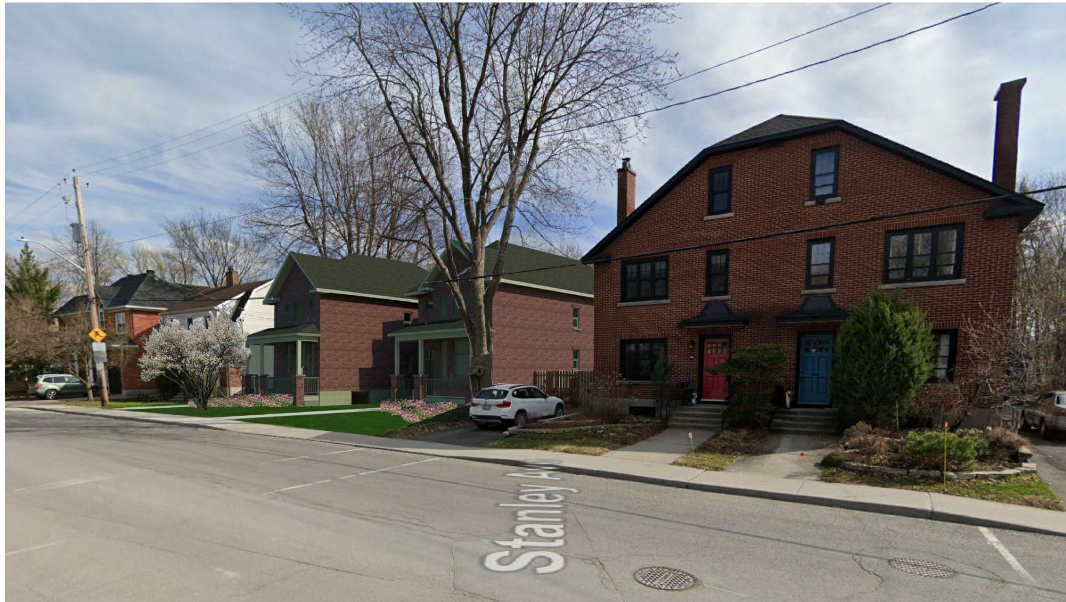
CONTEXT RENDERING FROM STANLEY AVENUE