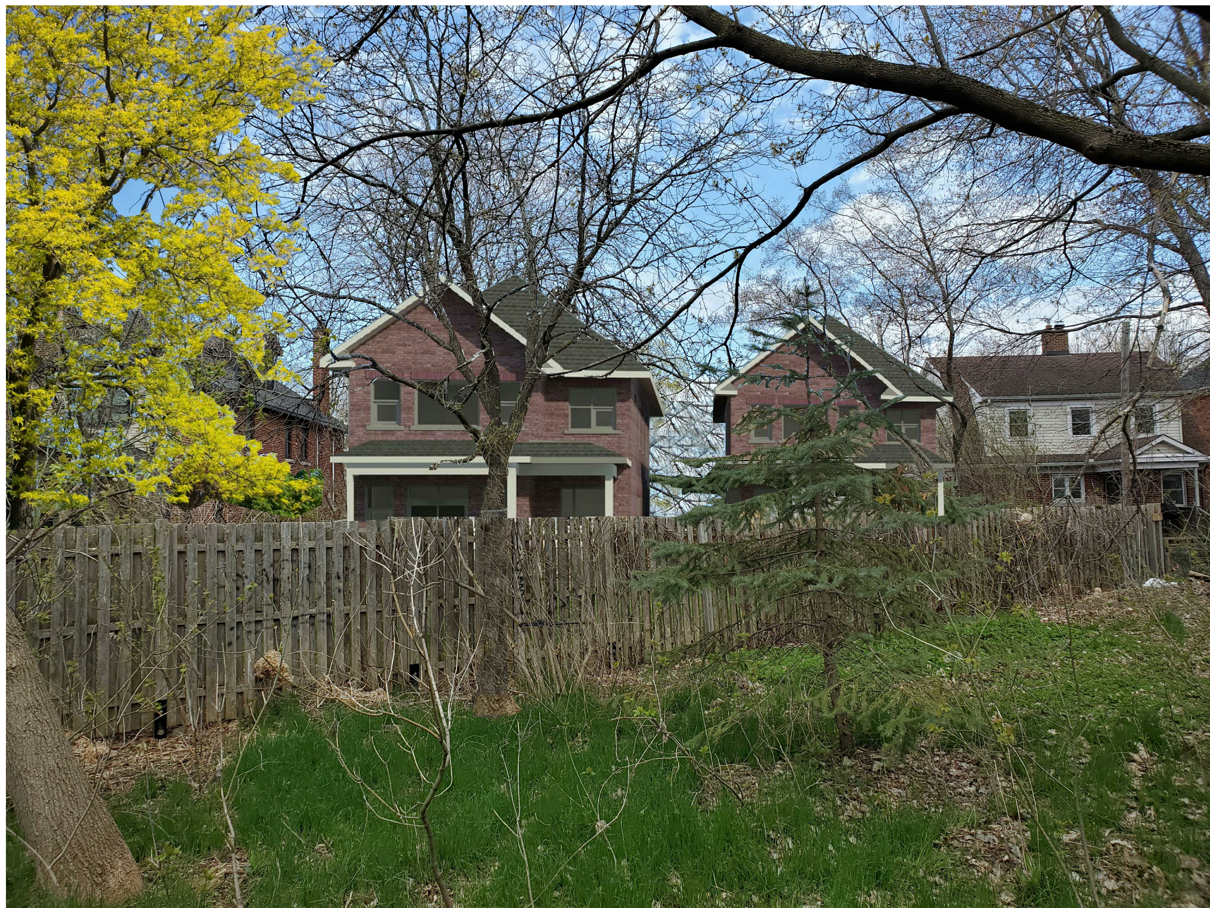
CONTEXT RENDERING FROM STANLEY PARK