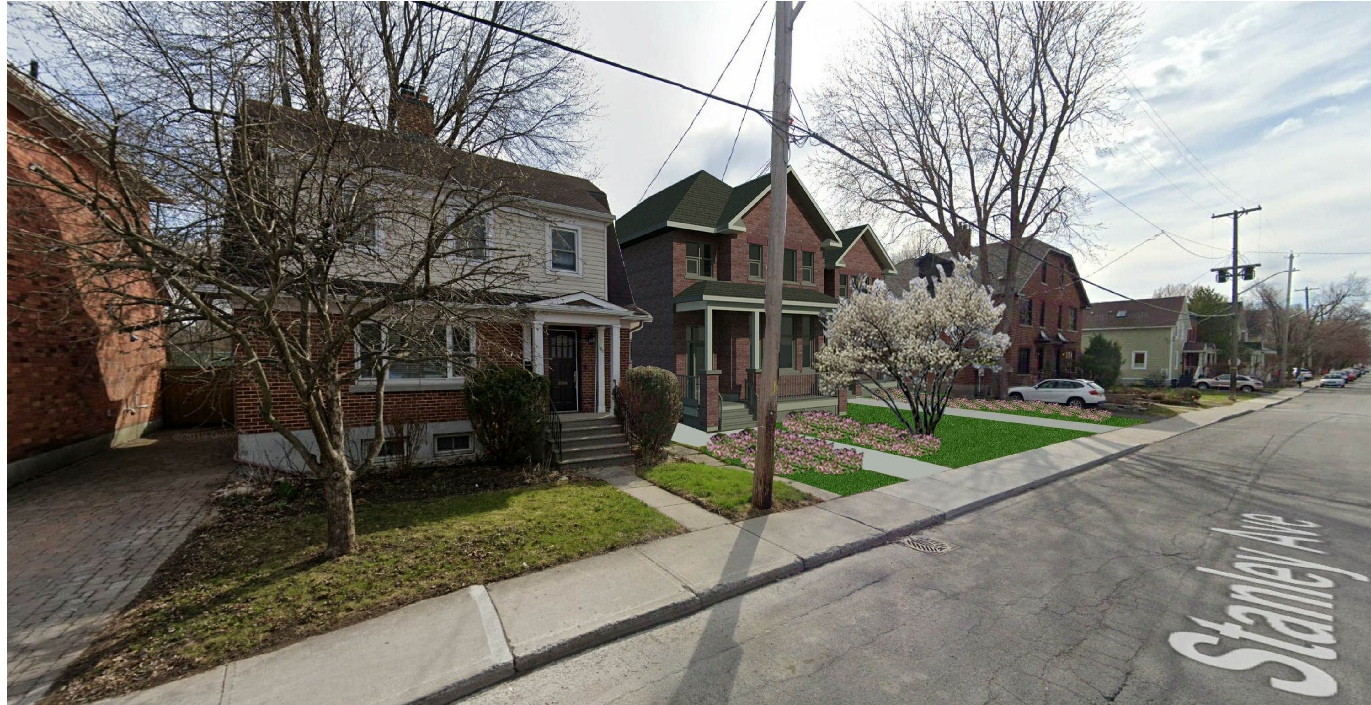
CONTEXT RENDERING FROM STANLEY AVENUE