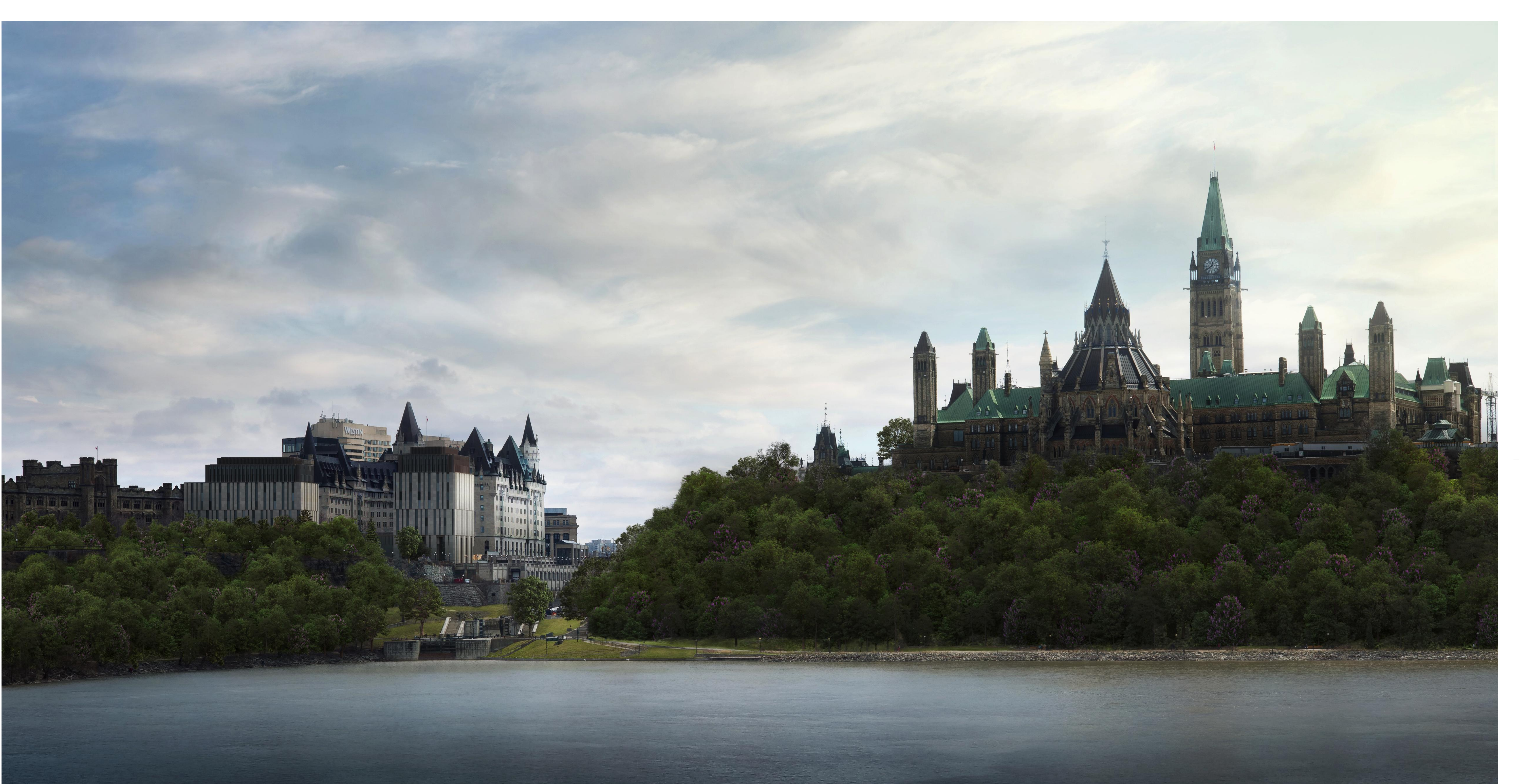
VIEW FROM THE OTTAWA RIVER

2. These Contract Documents are the property of the Architect. The Architect bears no responsibility for the interpretation of these documents by the Contractor. Upon written application, the Architect will provide written/graphic clarification or supplementary information regarding the intent of the Contract Documents. The Architect will review Shop Drawings submitted by the Contractor for design conformance only.