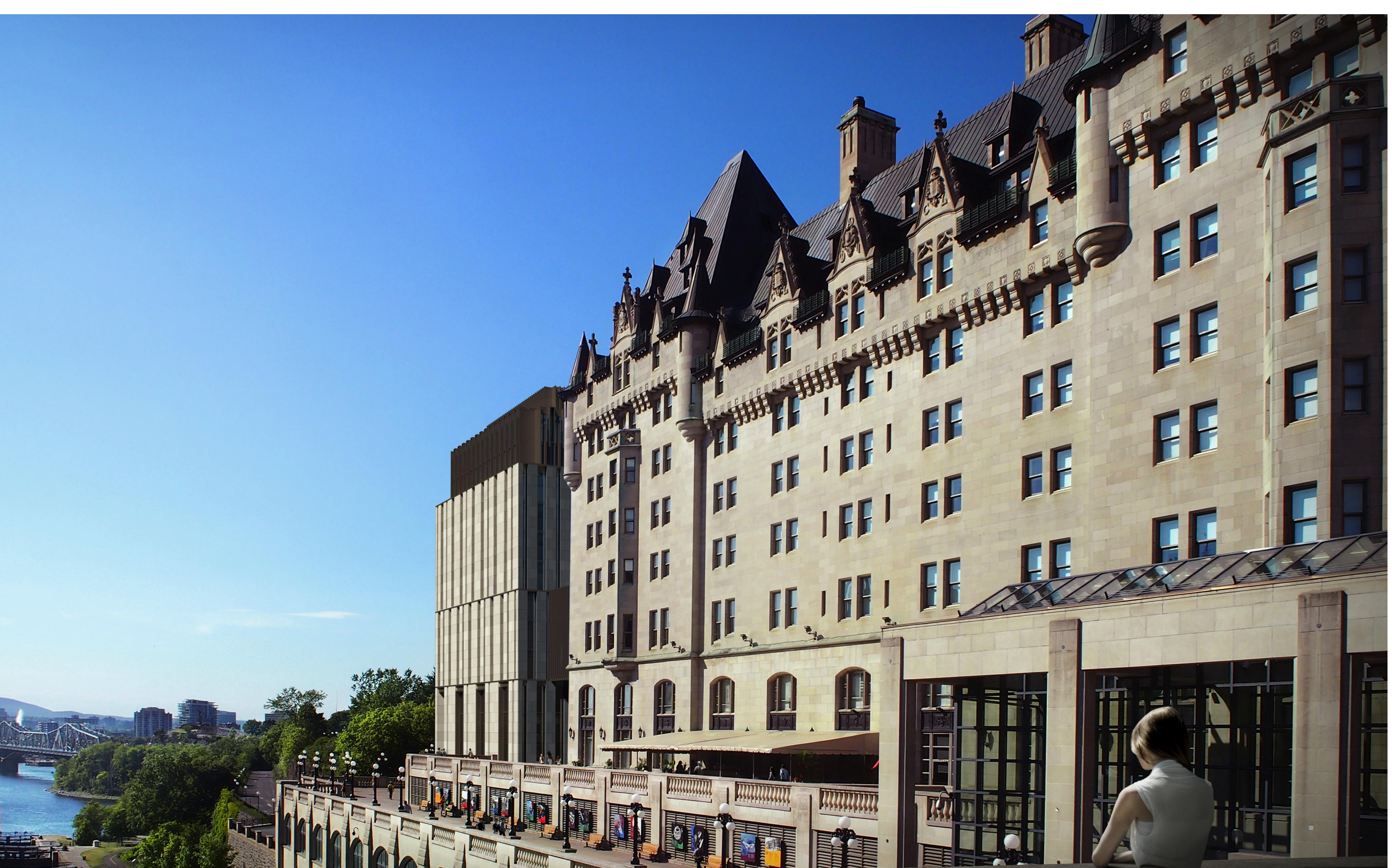
VIEW FROM THE WELLINGTON STREET BRIDGE

2. These Contract Documents are the property of the Architect. The Architect bears no responsibility for the interpretation of these documents by the Contractor. Upon written application, the Architect will provide written/graphic clarification or supplementary information regarding the intent of the Contract Documents. The Architect will review Shop Drawings submitted by the Contractor for design conformance only.