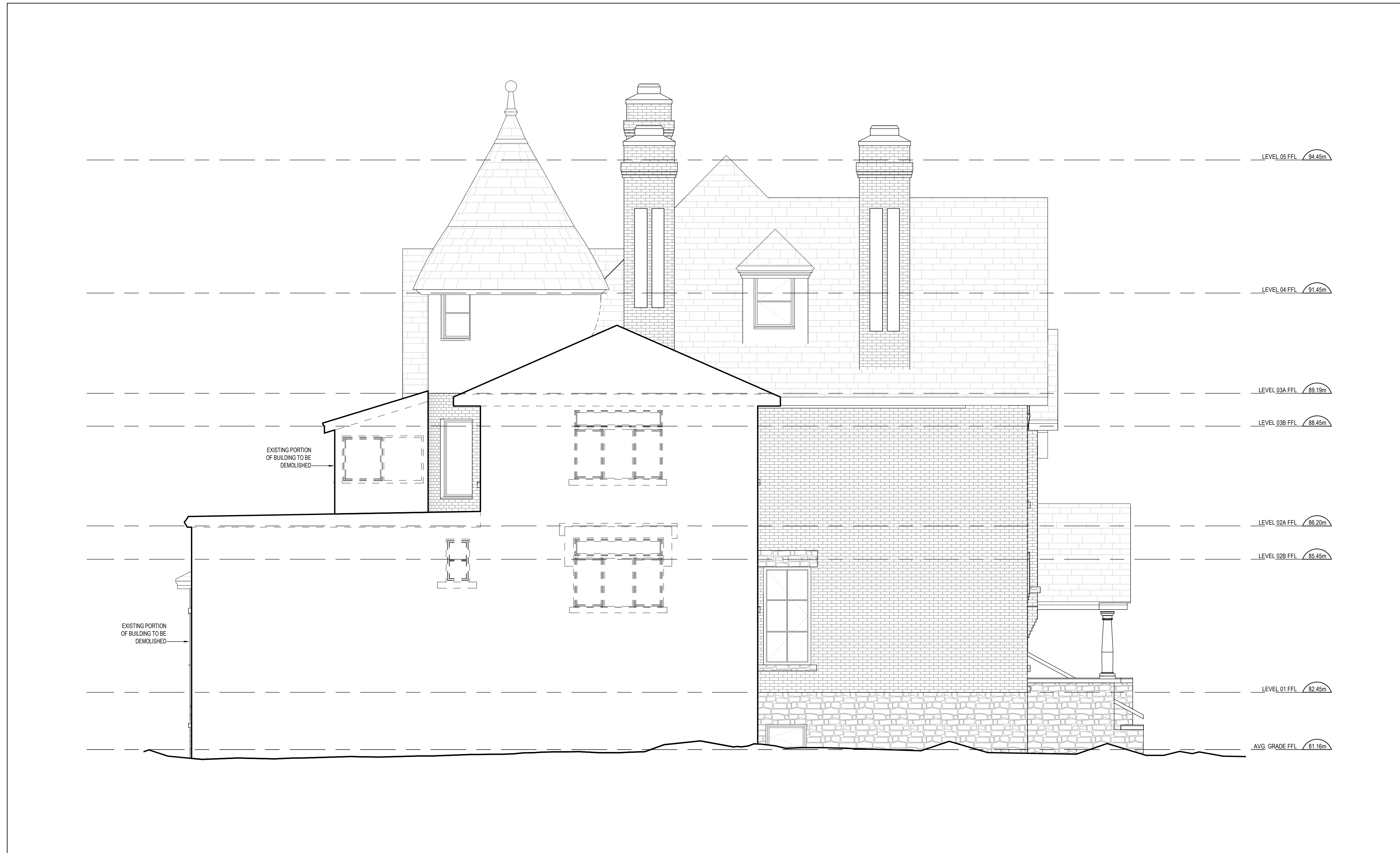
1 WEST ELEVATION - DEMOLITION D204 SCALE: 1 : 50

16 ISSUED FOR HERITAGE PERMIT 2020-12-08