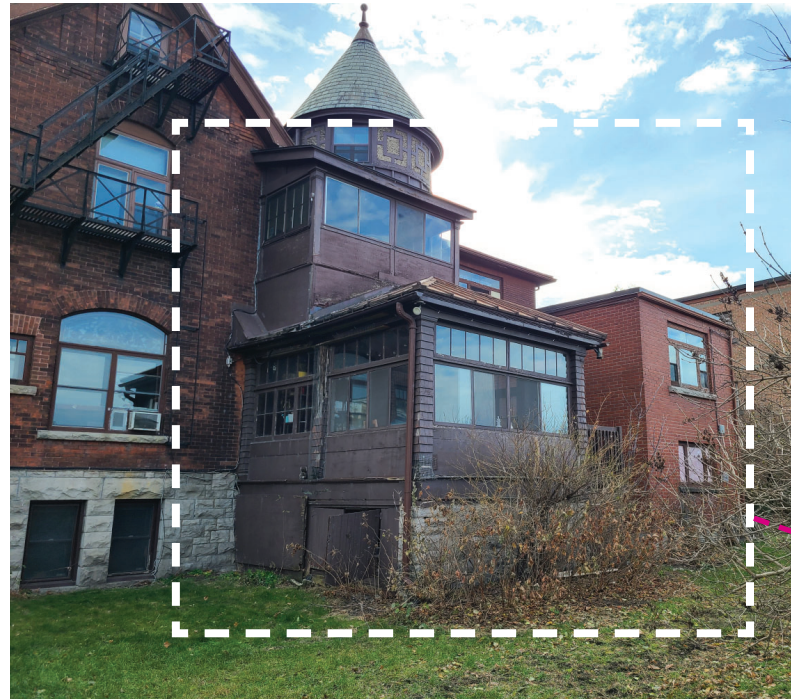
Wood structure on the north side of the building to be removed in its entirety, exposing more of the original brickwork. This will also expose the base of the turret.