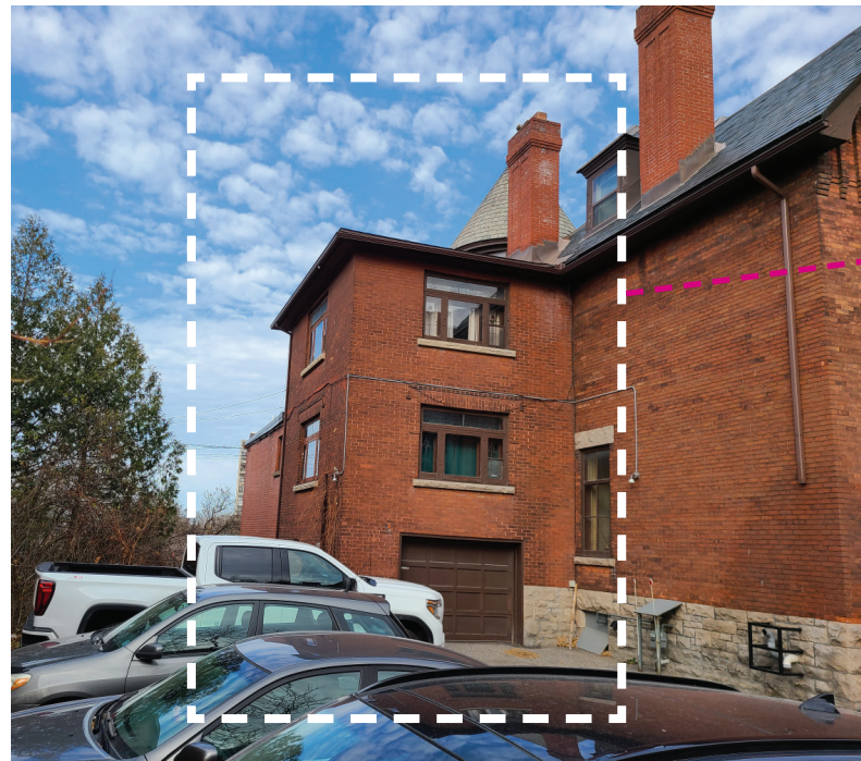
Brick veneer addition on the west side of the building will be removed in its entirety.