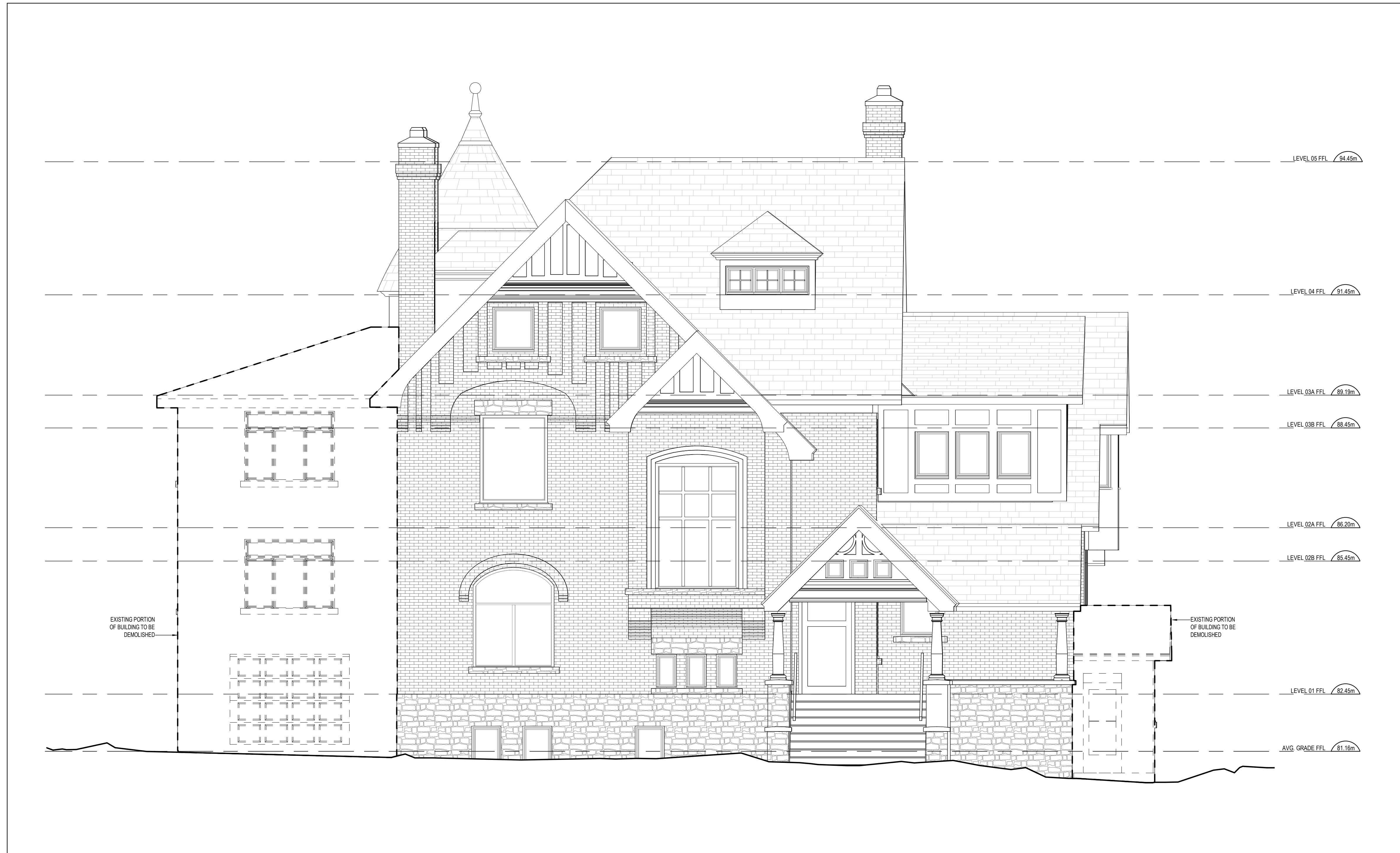
1 SOUTH ELEVATION - DEMOLITION D201 SCALE: 1 : 50

16 ISSUED FOR HERITAGE PERMIT 2020-12-08