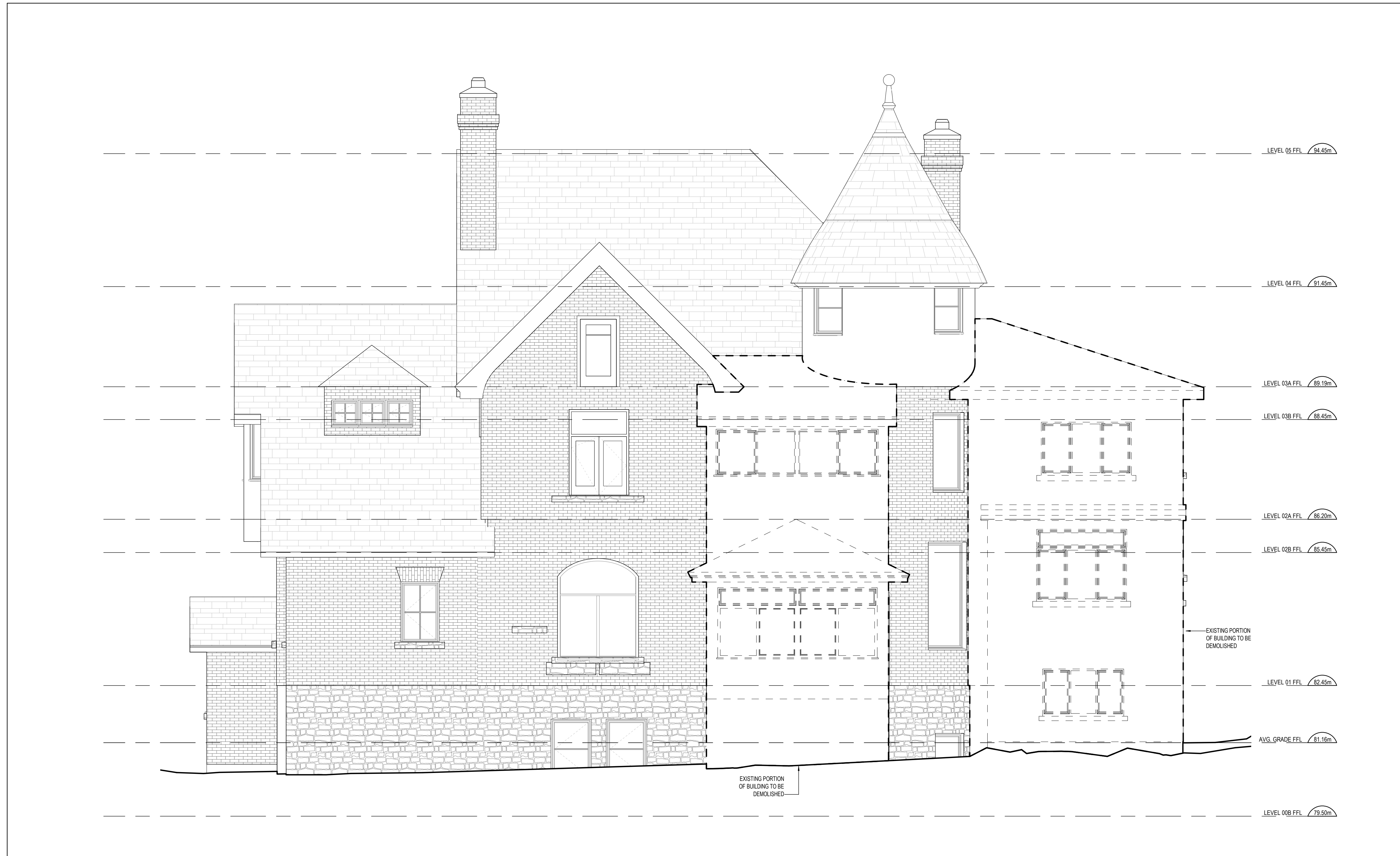
1 NORTH ELEVATION - DEMOLITION D203 SCALE: 1 : 50

16 ISSUED FOR HERITAGE PERMIT 2020-12-08