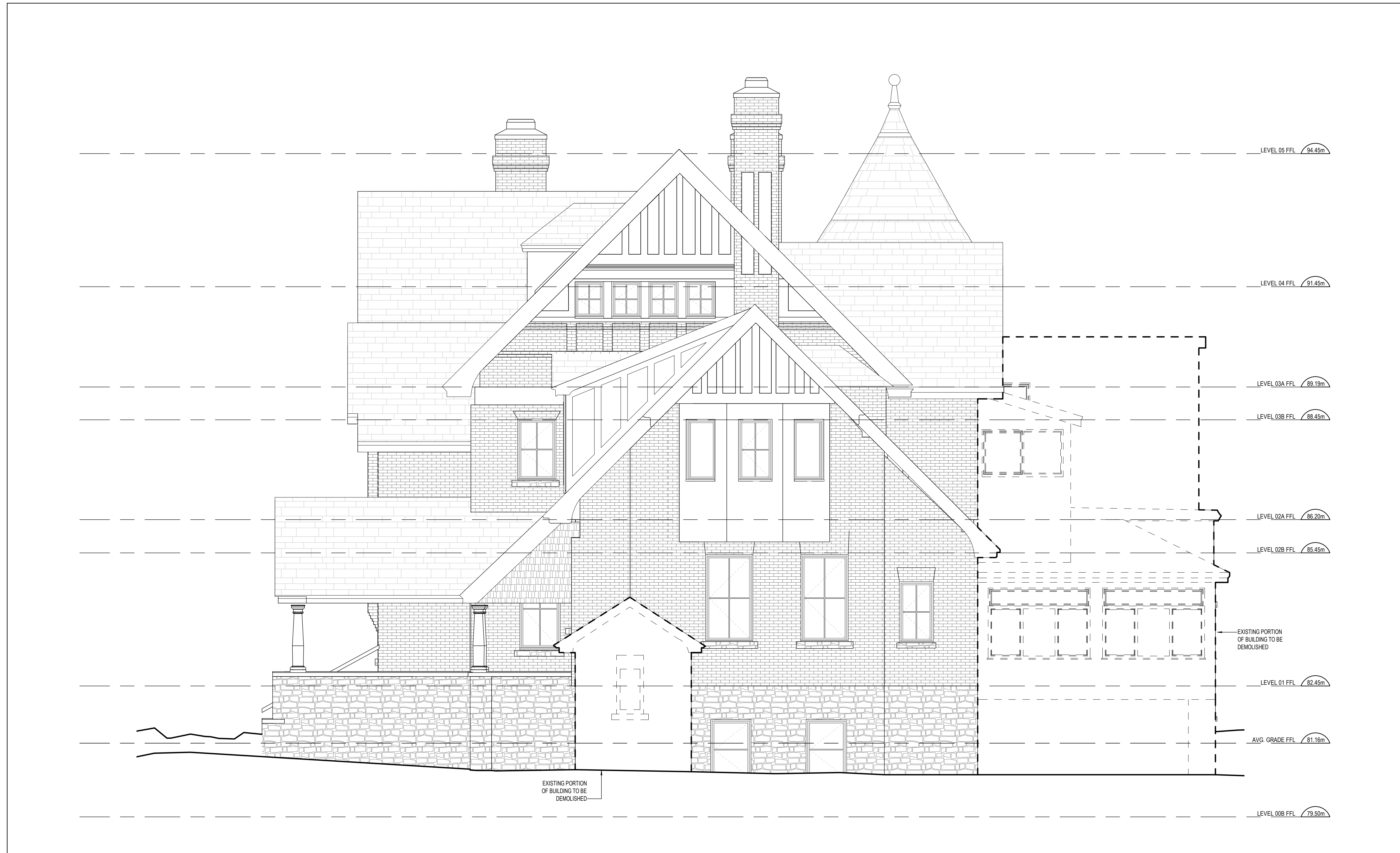
1 EAST ELEVATION - DEMOLITION D202 SCALE: 1 : 50

16 ISSUED FOR HERITAGE PERMIT 2020-12-08