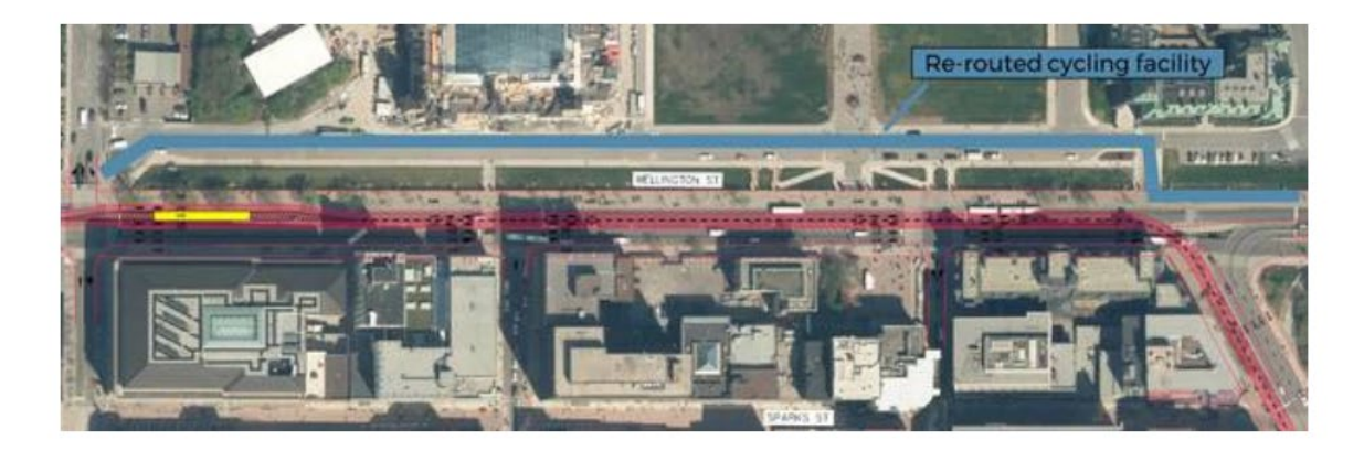
Option D: Continuous, but with reduced widths at the Parliament tram station

Note: the plan of option C is displayed east of Bank Street only because it is identical to option A west of Bank Street.