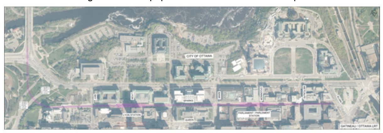
Legend: the tunnel for the tram coming from Gatineau and its stations are in purple, the O-Train tunnel is in black with stations in red.

The following is the concept plan for a tram tunnel under Sparks Street: