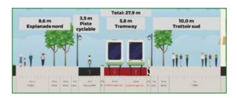
Sample cross-section of Option 2

The following provides a brief description of the main elements of this scenario to integrate a tram along Wellington Street: