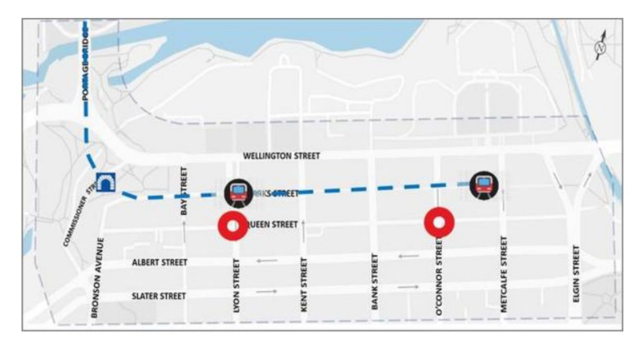
Proposed station locations for tunnel tramway option

Pedestrians could choose the quickest route out of the tunnel to their destination, including direct underground connections to the O-Train stations which would provide weather protected transfers. Exits would be strategically located to optimize access to users' final destinations.