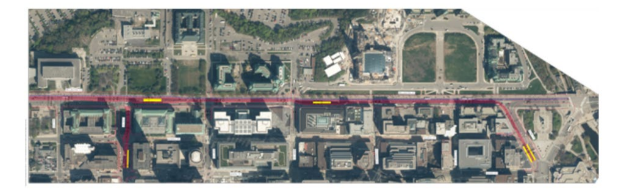
Legend: the tram line is in red, the stations in yellow, and the cycle path in blue.

The following plan shows the tram integration for this scenario: