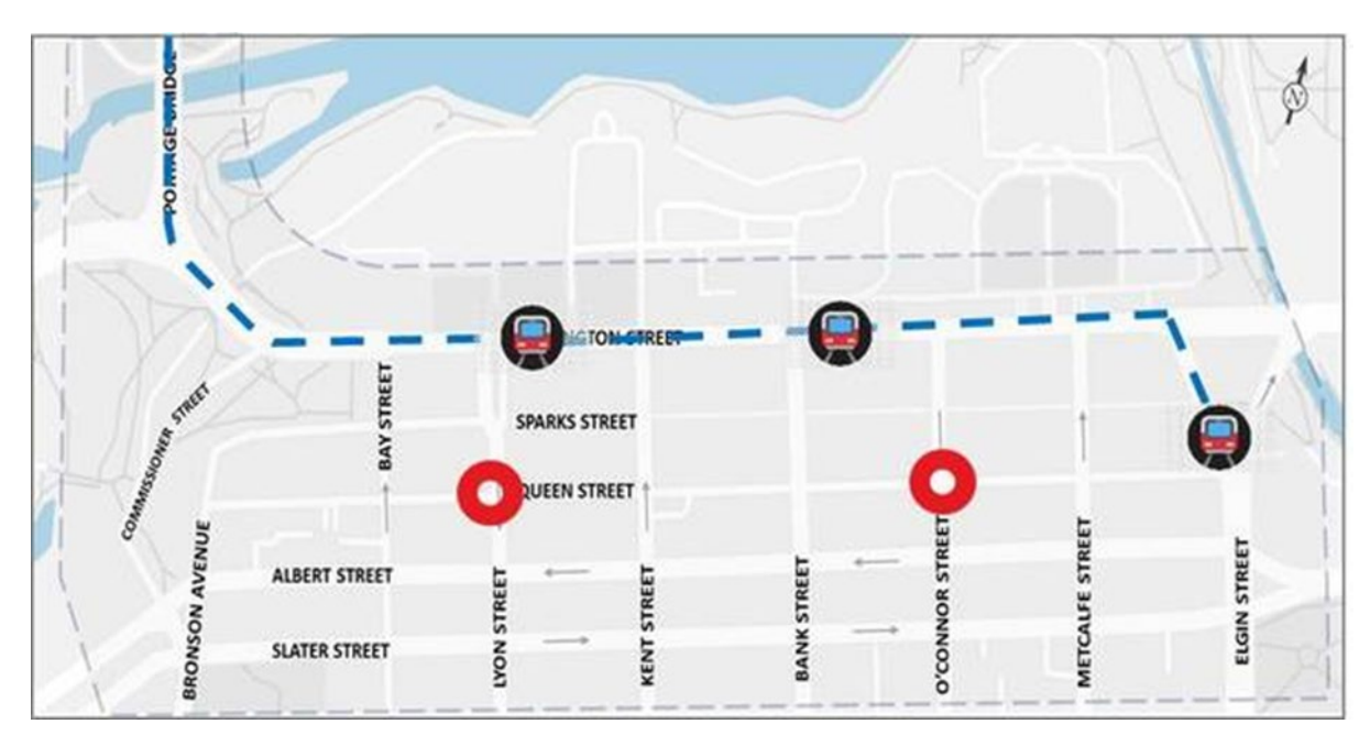
Proposed station locations for surface tramway option