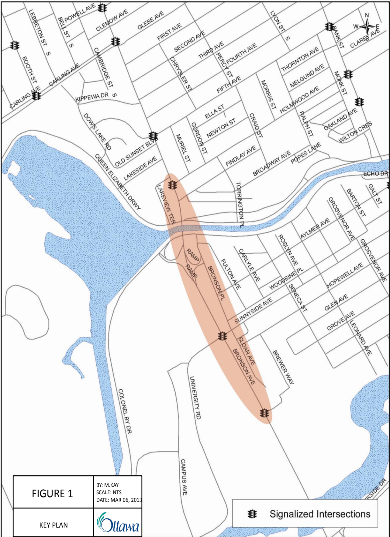
FIGURE 1 BY: M.KAY SCALE: NTS DATE: MAR 06, 2013