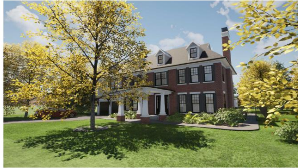
FRONT RIGHT PERSPECTIVE

Document 11 - Jim Bell Architectural Design Inc dated and received September 3, 2020