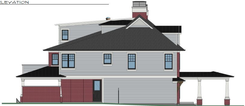
Ⓦ WEST (LEFT) COLOUR ELEVATION