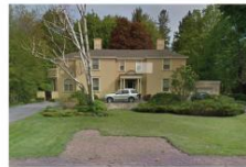
275 Mariposa Avenue