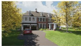
235 Mariposa Avenue