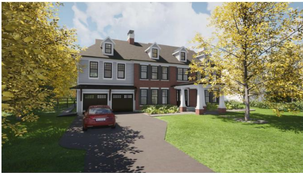
FRONT LEFT PERSPECTIVE