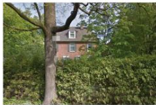
216 Manor Avenue