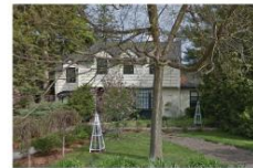
285 Mariposa Avenue