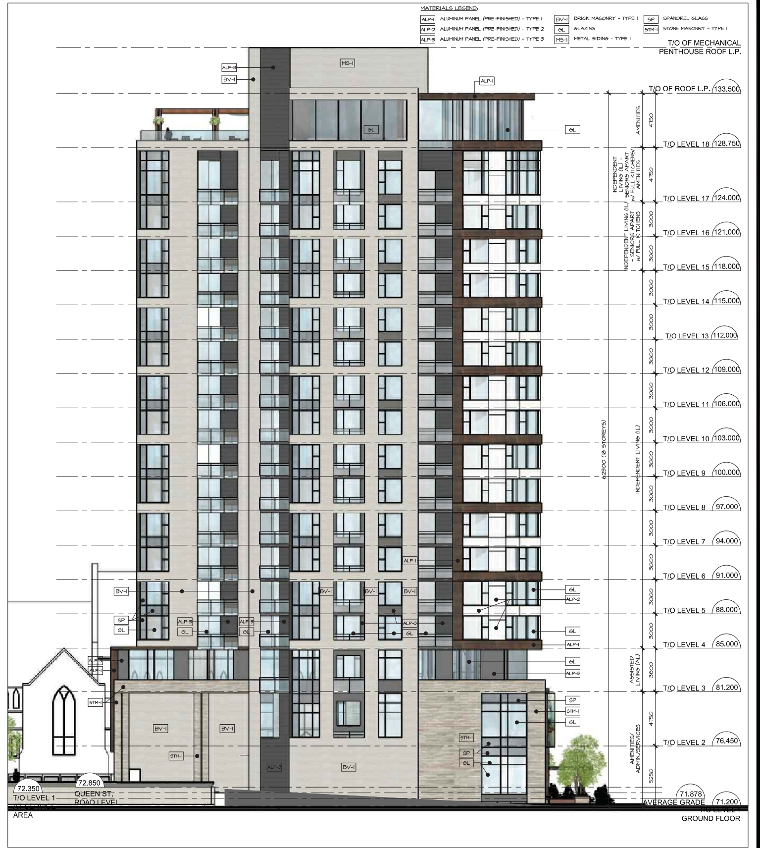
Proposed East Exterior Elevation