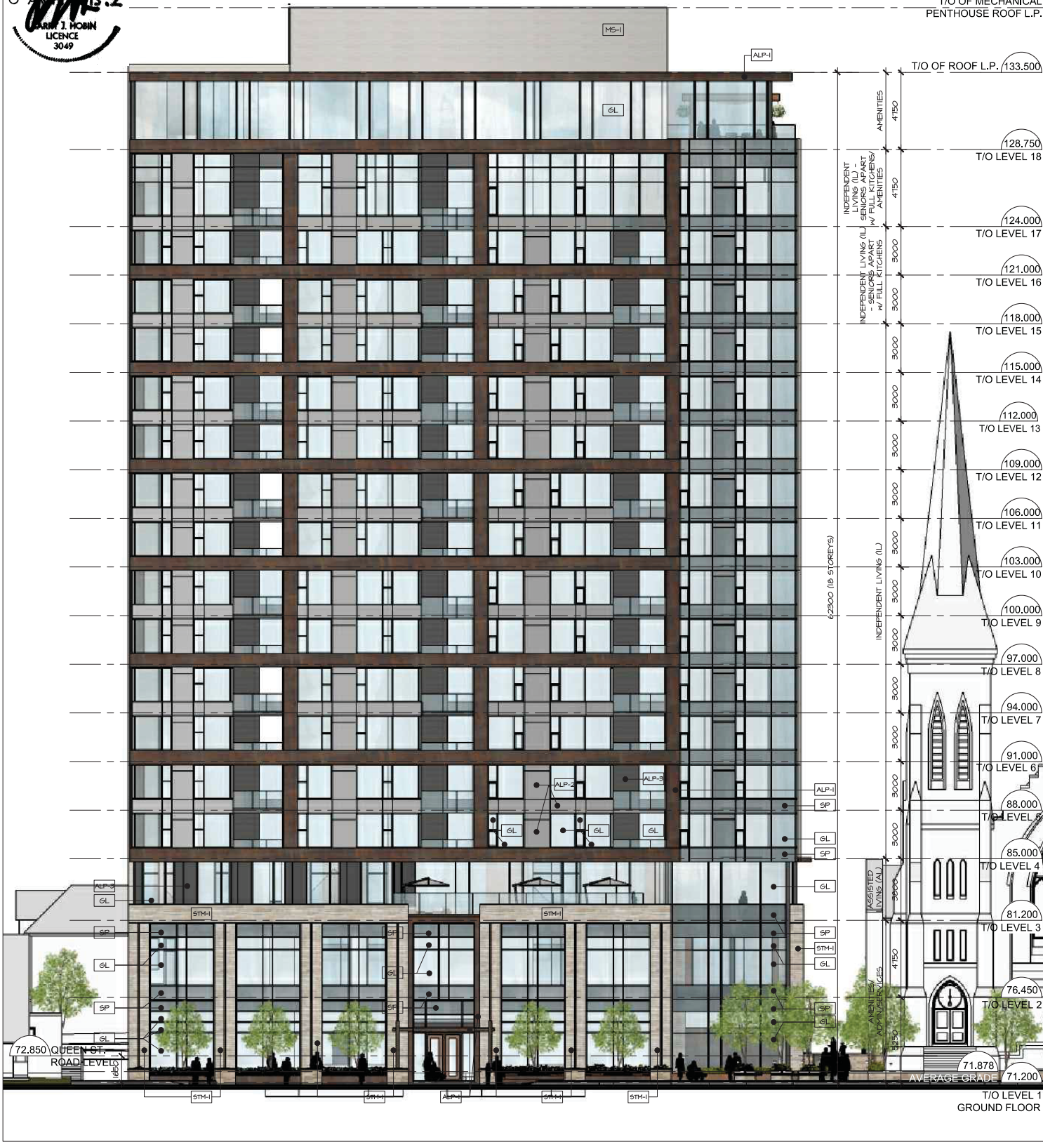
Proposed North Exterior Elevation