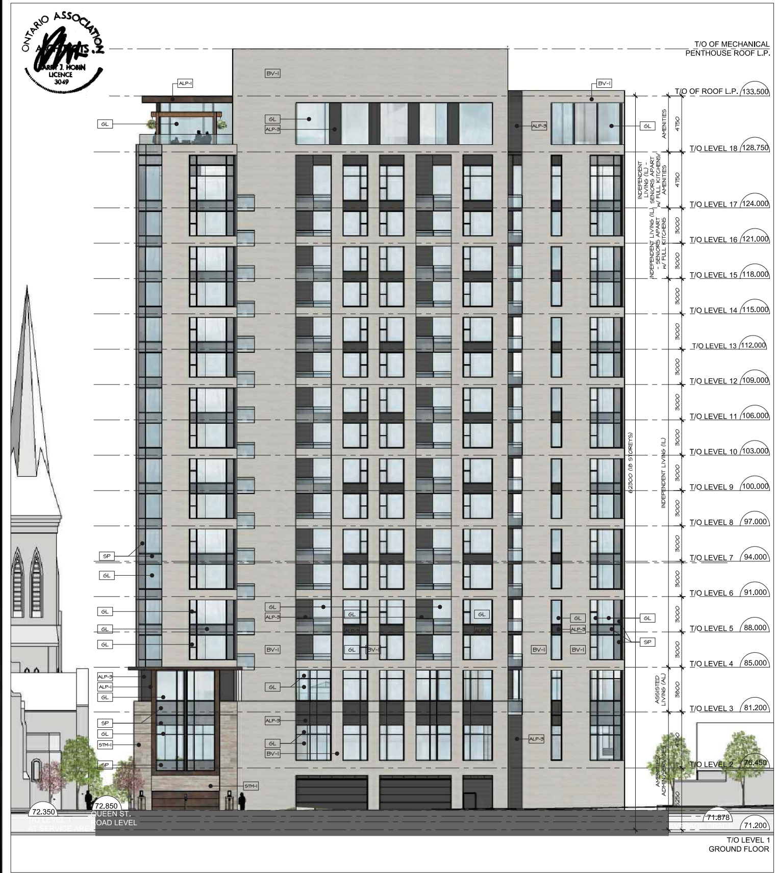
Proposed South Exterior Elevation