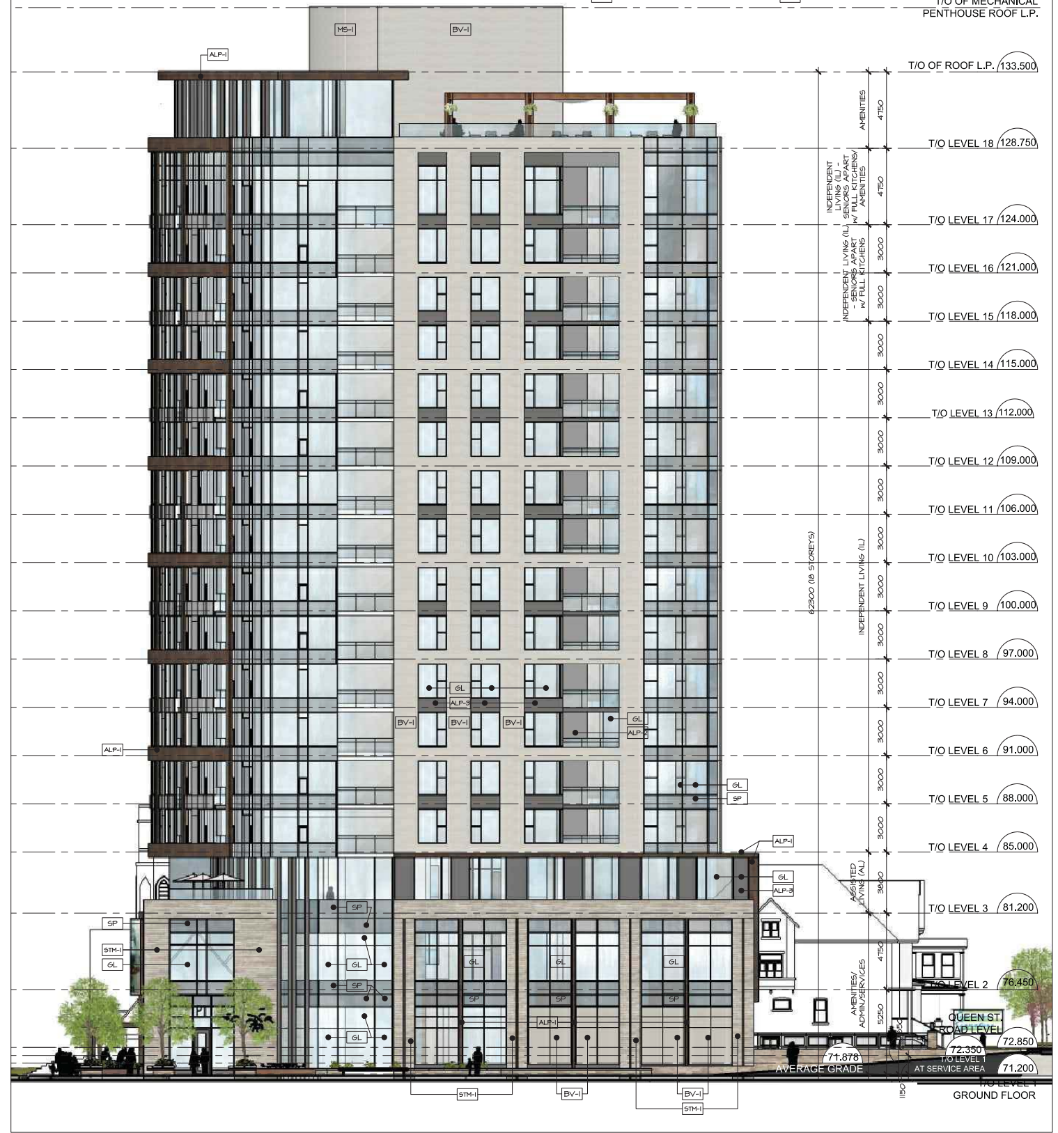
Proposed West Exterior Elevation