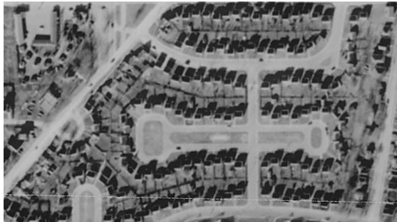
Figure 4 - 1958 aerial image of Veterans' Housing Project No. 1, GeoOttawa, 2022.

The veterans' homes were built according to the familiar WHL plans. For each of the nearly 26,000 rental homes constructed across Canada by WHL, there were only four essential design layouts. 55 The interior arrangements always included a living room, a kitchen, one bathroom, and anywhere from two to four bedrooms, depending on whether the model had an upper storey. 56 The interior layouts followed the same general patterns, but the placement of the living room might trade places with the kitchen from one plan to the next. 57 However, there were no entry halls, or dining rooms.