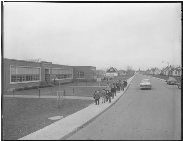
Figure 11 - A photograph of children walking along Anna Avenue in front of W. E. Gowling Public School, Ottawa, 1955

A major milestone in the area's development came in May 1947 with the opening of the W. E. Gowling Public School. 106 Before this, Carlington school kids were bused to the Elgin Street Public School in downtown Ottawa. They could not attend the nearby Maxwell Public School because it was part of Nepean Township, and Carlington had been annexed to Ottawa. 107 The opening of Gowling consolidated the community character of the area, whose significant grade-school demographic finally had a local education space of their own where they could learn and socialize. In the evenings and on weekends, the school doubled as a community event space for dances and meetings that brought together other members of the neighbourhood. 108 This community was united through their shared histories: while they may not have understood the psychological nuance of Post-Traumatic Stress Disorder (PTSD), they certainly understood its impact. The street parties, volunteering