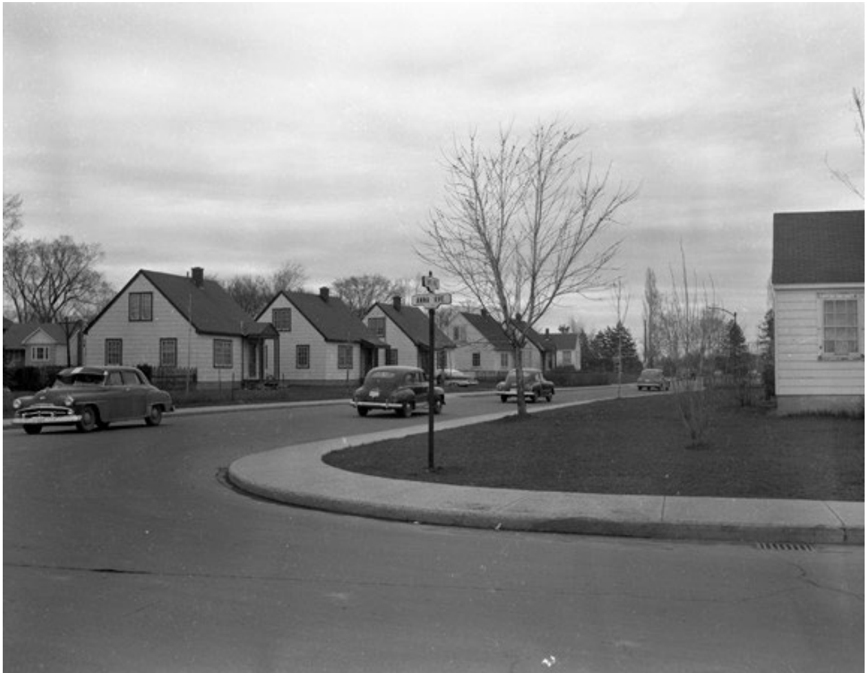
Figure 5 - A photograph of Tunis Avenue, Ottawa, 1956 / City of Ottawa Archives / CA038365.

There were even fewer options for the building's exterior. Every house was a simplified interpretation of the 1930s Cape Cod cottage: plain frames of single-pitched and side-gabled structures that were either bungalows or one-and-a-half storeys within a condensed, rectangular plan. 58 Exterior sidings were uniform, and were either wood clapboard or asbestos. Minor variety on the exterior was achieved through the occasional "flip" of the front entrance's placement. Depending on the interior layout of the home, the entrance would either sit at the centre, right, or left of the front façade. 59