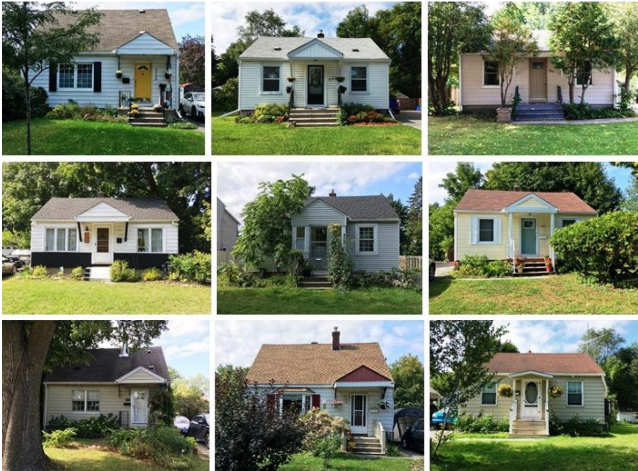
Figure 13 Photographs of veterans' homes along Fisher Avenue, Ottawa, September 2021, City of Ottawa.

residents of the veterans' housing subdivisions demonstrated this through their numerous modifications to the WHL design, which they were able to carry out once they were property owners. 117 Common alterations include the addition of detached garages, attached additions at the rear of homes to create more space (and the less common second storey additions for the same reason), changes to the siding material, expansions to front porches, and window replacements, among other interior modernizations.