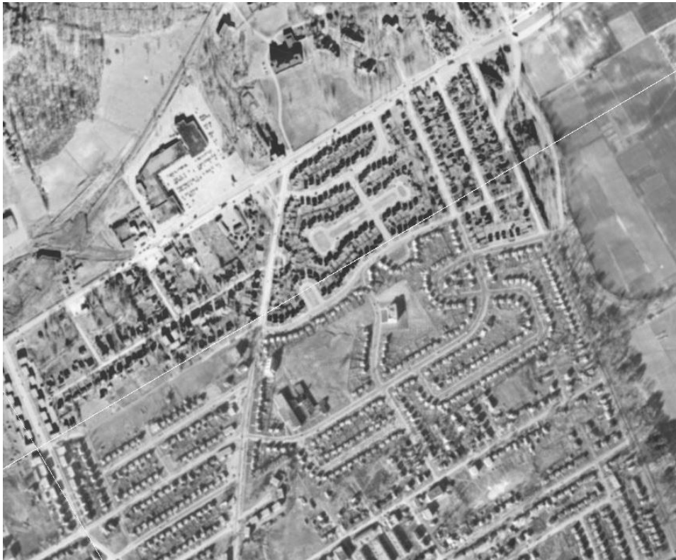
Figure 10 - Detail of 1958 aerial photograph, GeoOttawa, City of Ottawa.

increase the size of the project, Nepean had some reservations: it had come to their attention that applications for tenancy in Project No.1 were only being considered from veterans that were residents from the city of Ottawa. 91 Since there had been no provision to include Nepean residents in the original agreement, this qualifier could not be modified. 92