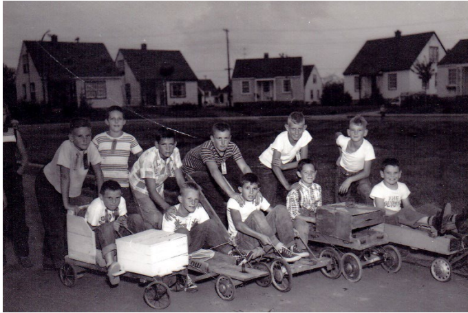
Figure 12 - Soap box stock car racing in Harrold Place, Ottawa, 1954 / City of Ottawa Archives / CA005022.

opportunities, and social events were their makeshift and local methods of therapy and healing. 109