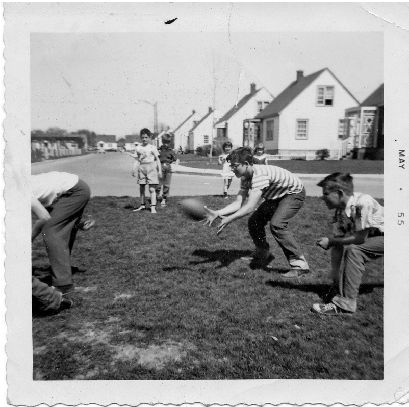
Figure 8 - 1955 photograph of Harrold Place.

The size of the veterans' homes is further emphasized by the large lots on which they are situated. Every lot is approximately 2000 square metres, with room at the rear of the property provided for gardening, or even small livestock. 82 The idea behind this small-house-to-large-lot ratio was to provide tenants a way to produce their own food as a failsafe against food shortages. In doing so, WHL meant to deter a repeat of the conditions that had followed the First World War. 83 While this concept was more prevalent in the housing projects