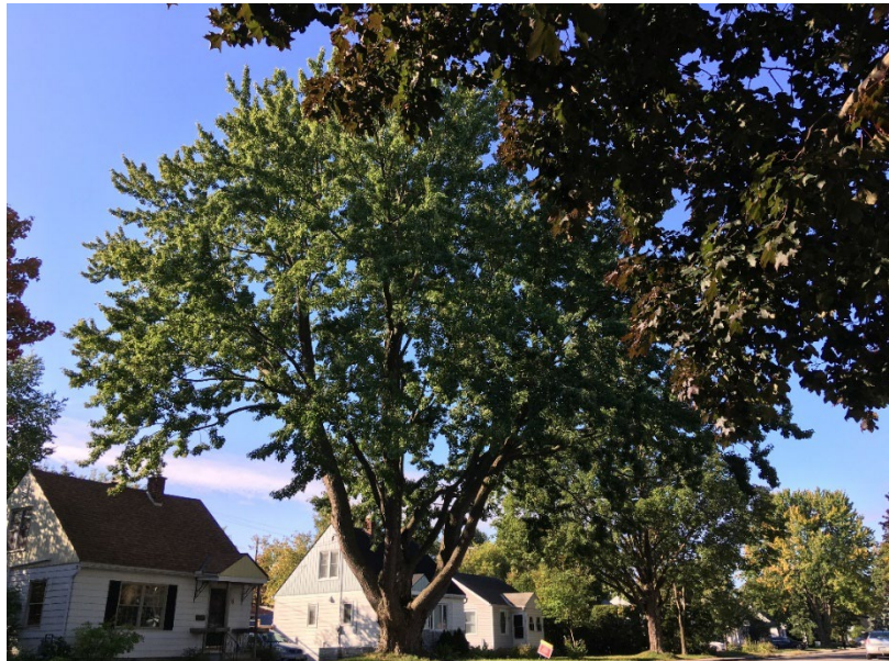
Figure 9 - Photograph of mature trees on Marshall Avenue, Ottawa, September 2021, City of Ottawa.