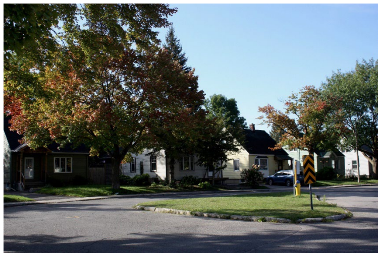
Figure 14 - Photograph of veterans' houses and grassy median island on Viscount Avenue, Ottawa, September 2021, City of Ottawa.

By 1949, the projects from both Wartime Housing Limited and CMHC had completed a combined total of 45,930 housing units and CMHC had already started on an additional 49,611. 120 These houses were built in subdivisions from coast to coast to create a national icon of construction recognized for its ubiquity, rather than its rarity. 121 As a result, it can be easy to overlook the impetus of their construction: these were purpose-built communities for specific tenant demographics, built on specific sites.