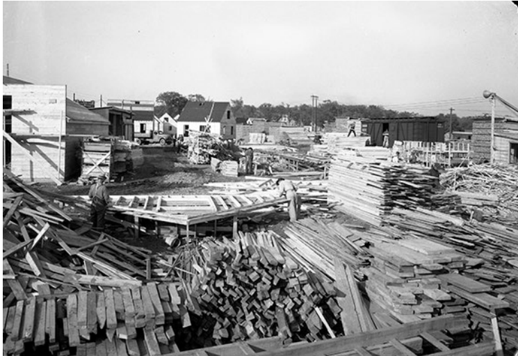
Figure 1 - A photograph of Veterans' Housing Project No. 1 under construction on Carling Avenue, Ottawa, 1945 / City of Ottawa Archives / CA024989.

Because WHL was supported by federal funding, cost effectiveness was a requirement. 17 As a result, housing design had to stay on budget and make the most of every dollar. Decorative elements in the houses were limited and luxury materials were entirely absent.