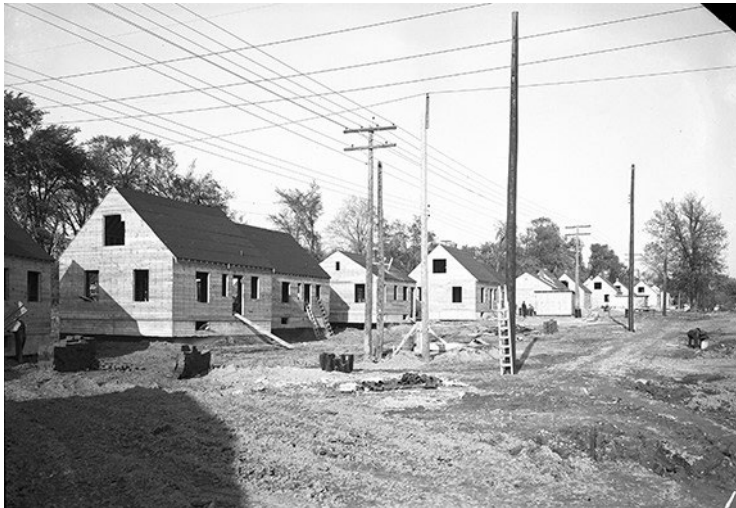
Figure 2 - Wartime homes on Carling Avenue, mid-construction, Ottawa, 1945 / City of Ottawa Archives / CA024990.

manufacturing work came to an end, there would be no employment for the workers, and therefore no need for the workers' houses. The idea was that the construction methods used to build these houses should be easily reversible so that the houses could be dismantled. 25 To allow for this, early WHL houses were built on cedar posts (or concrete blocks at locations where the natural soil was more wet) in lieu of full foundations with basements. 26