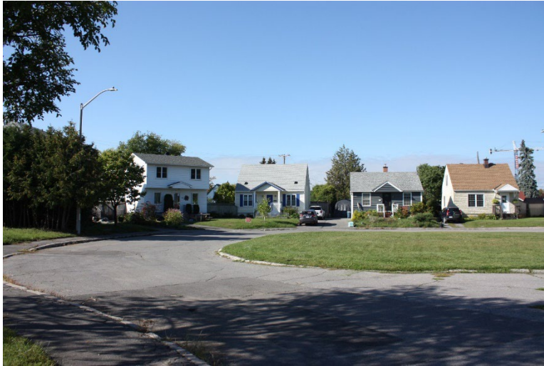
Figure 6 - Photograph of Harrold Place, Ottawa, September 2021, City of Ottawa.