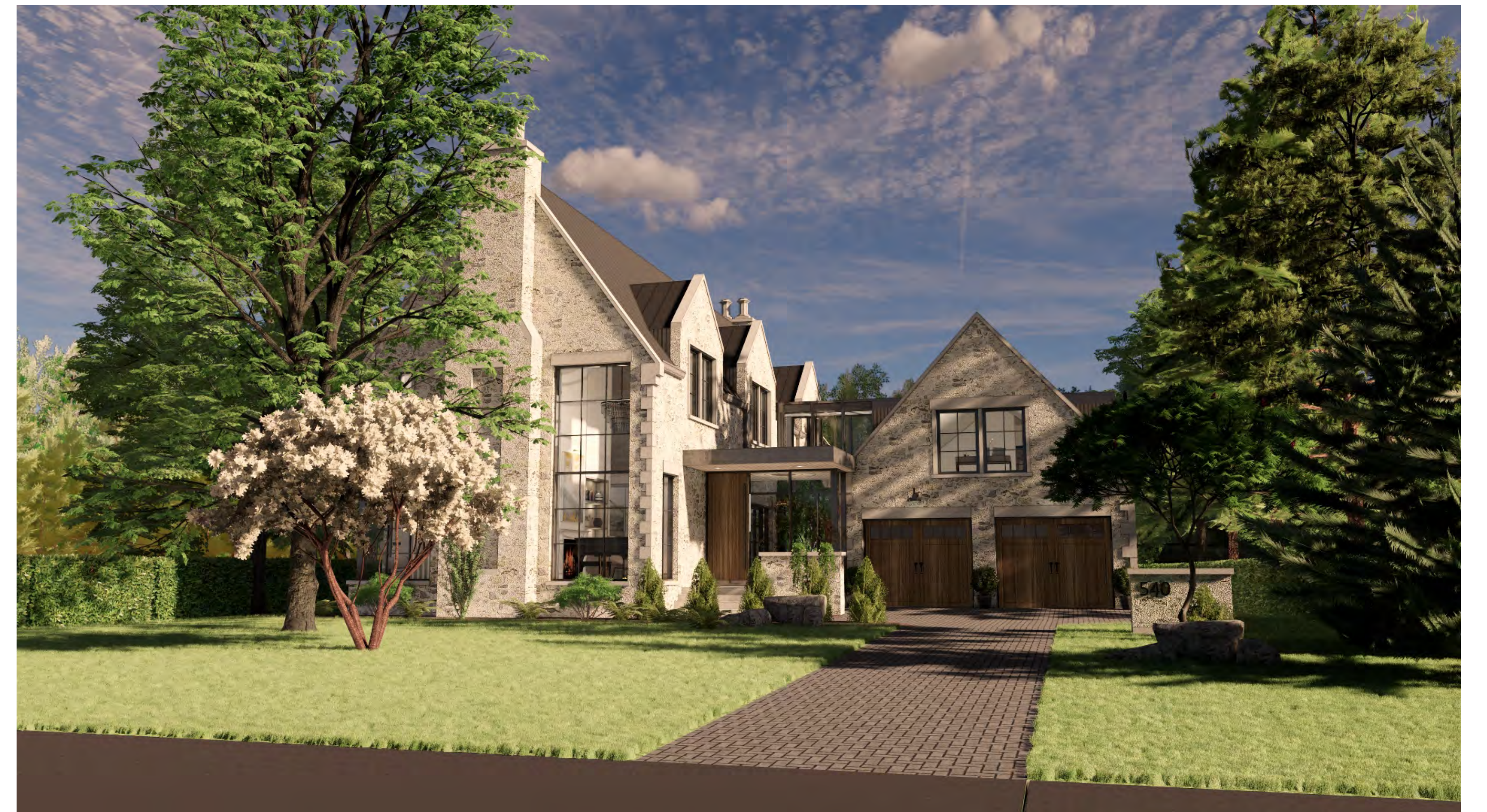
A 1 3D RENDERINGS OF FRONT ELEVATION N.T.S.