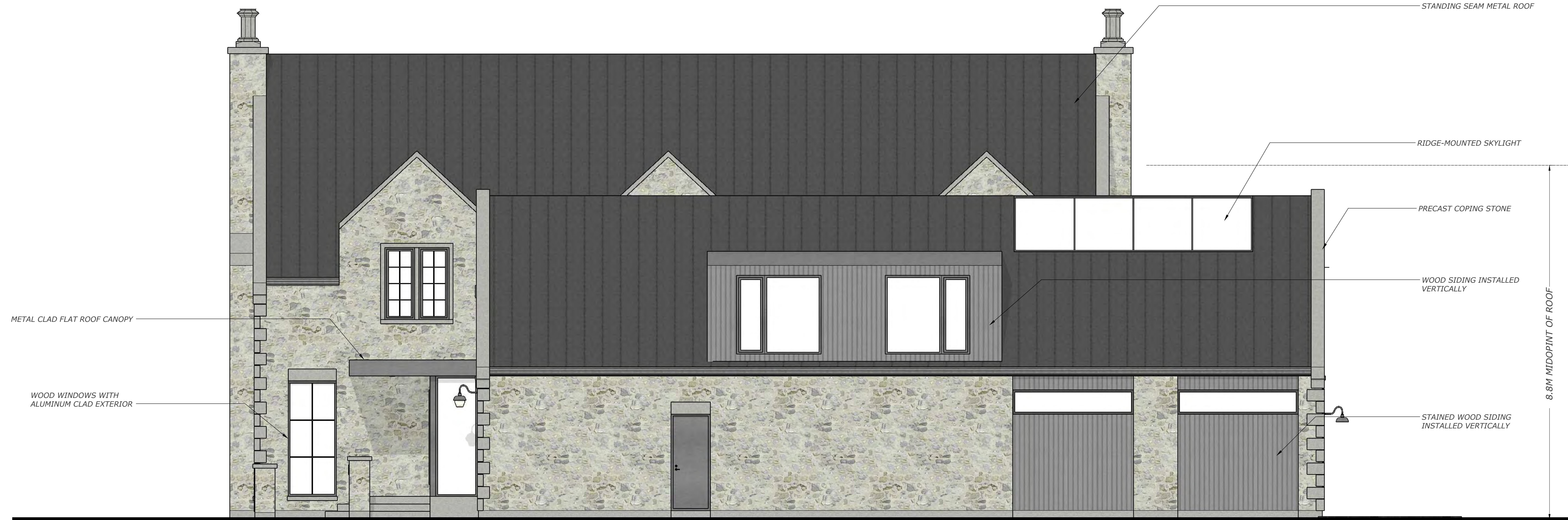
A 1 PROPOSED RIGHT ELEVATION 1/4"=1'-0"