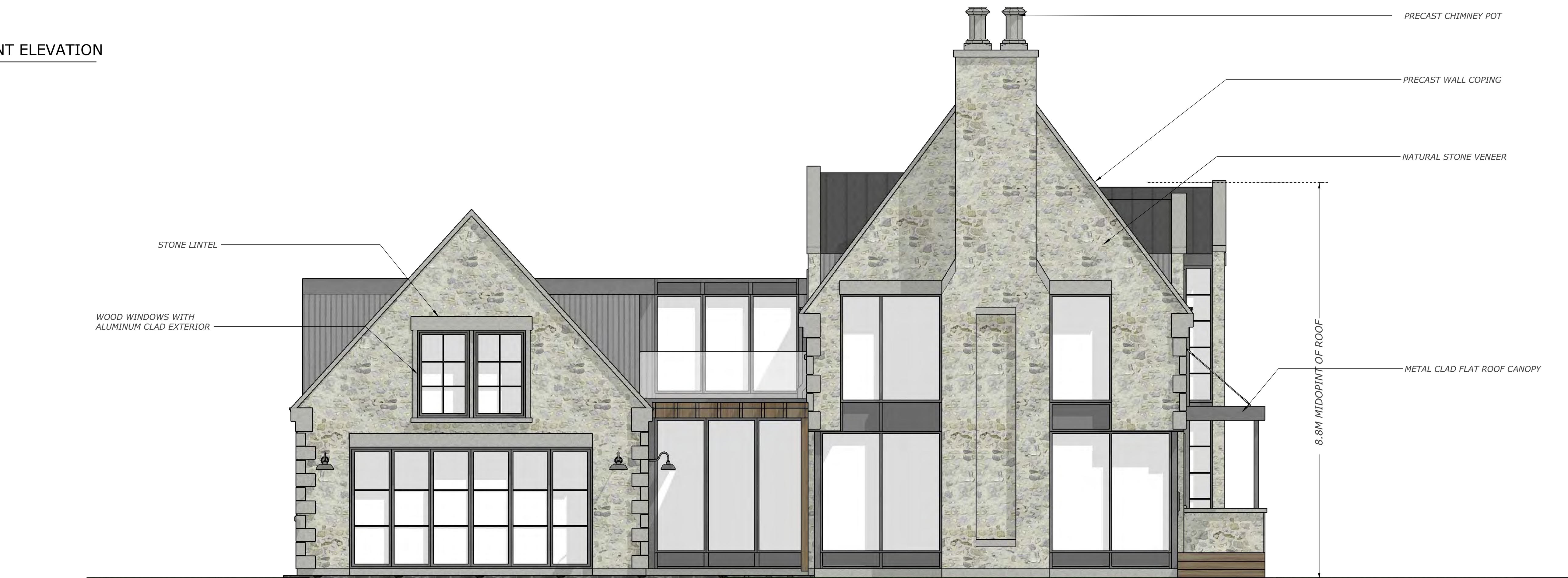
A 1 PROPOSED FRONT ELEVATION 1/4"=1'-0"