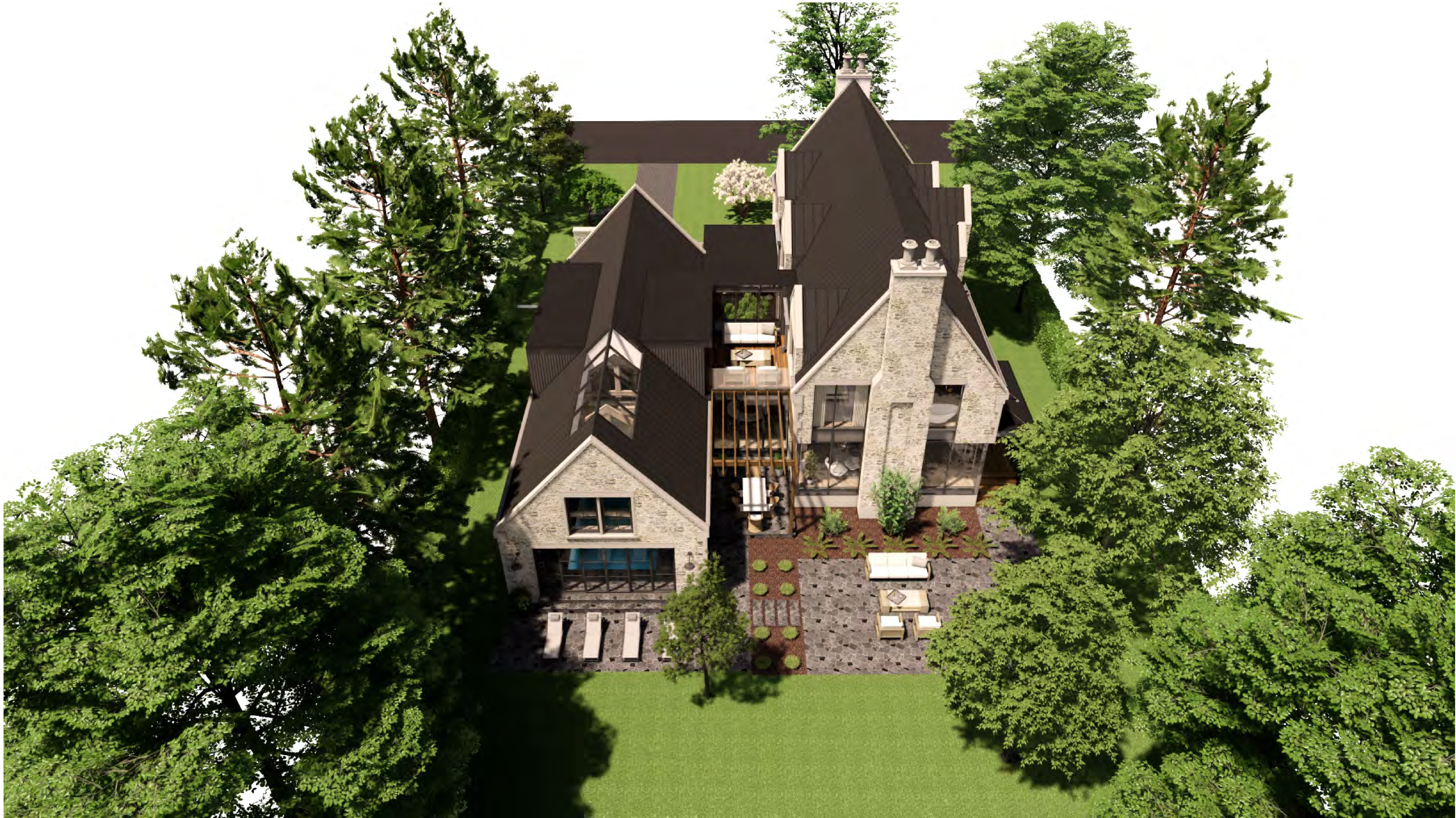
A 1 AERIAL VIEW OF REAR ELEVATION N.T.S.