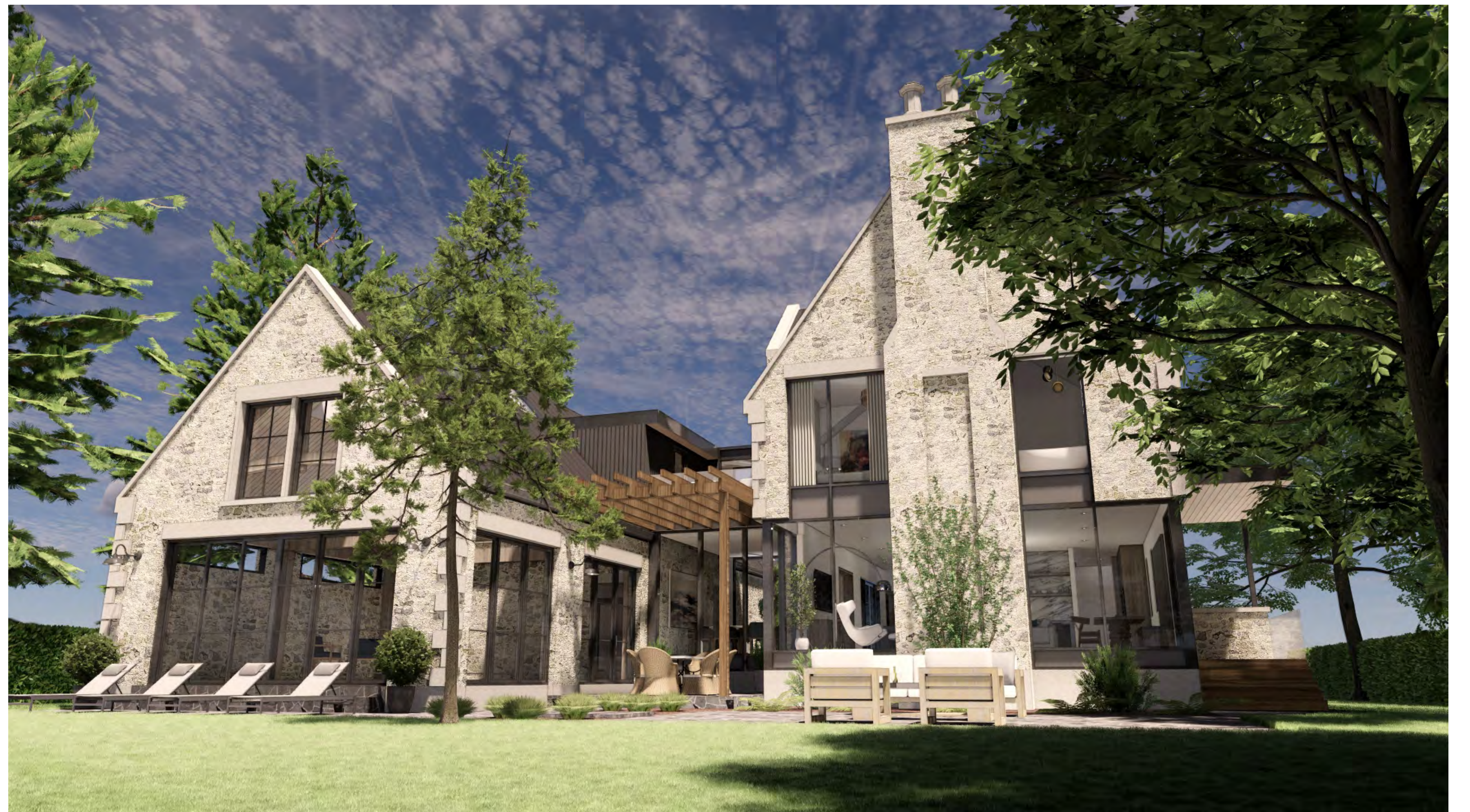
A 1 3D RENDERINGS OF REAR ELEVATION N.T.S.