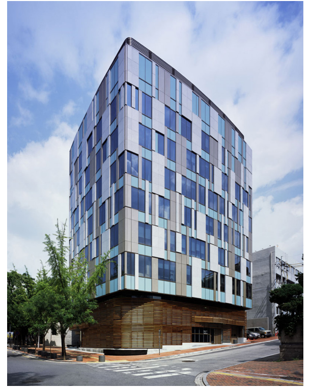
Contemporary architectural expression, Canada Embassy in Seoul. Architects, Zeidler Partnership.

context to the character of surrounding buildings and the location of the mission. High quality materials are more aesthetically pleasing, and they