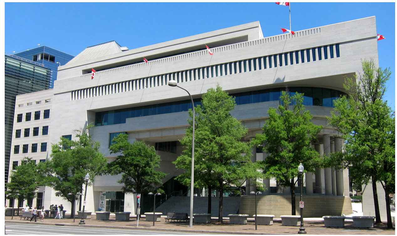
Presence on the street. Canada Embassy in Washington, DC. Architect, Arthur Erickson.

• Efforts should be made to provide pedestrian access and amenable interaction with the facility.