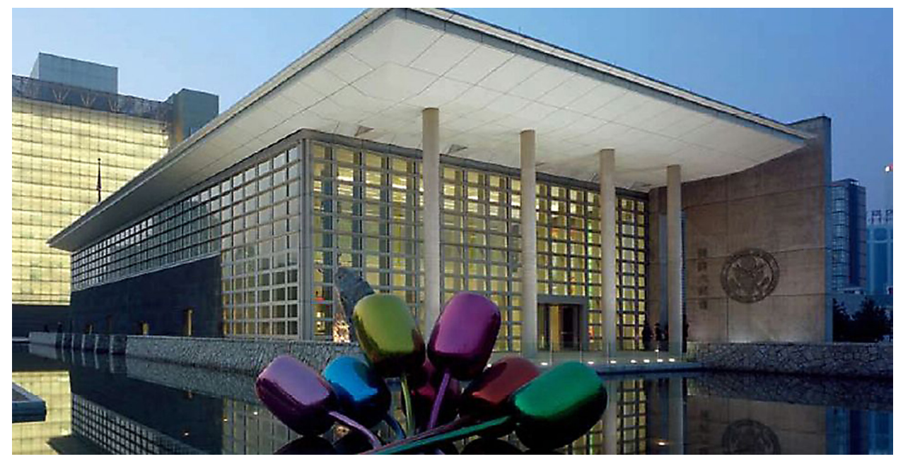
Integration of security with the landscaping and the siting: a reimagined moat, USA Embassy in Beijing. Architects : SOM; landscape architecture : PWPLA