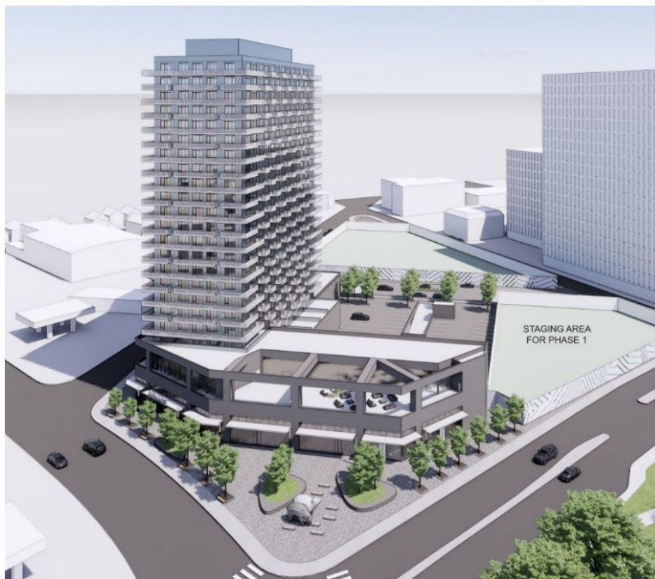
Figure 19: Perspective View from North River and Montreal Road, HOK (Phase 1)